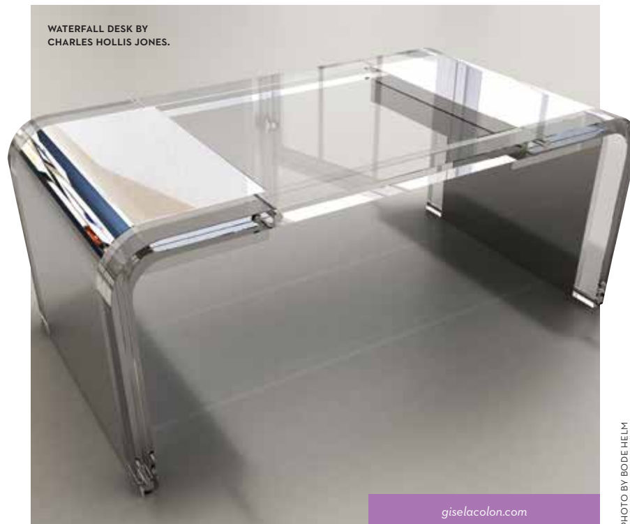
WATERFALL DESK BY CHARLES HOLLIS JONES.