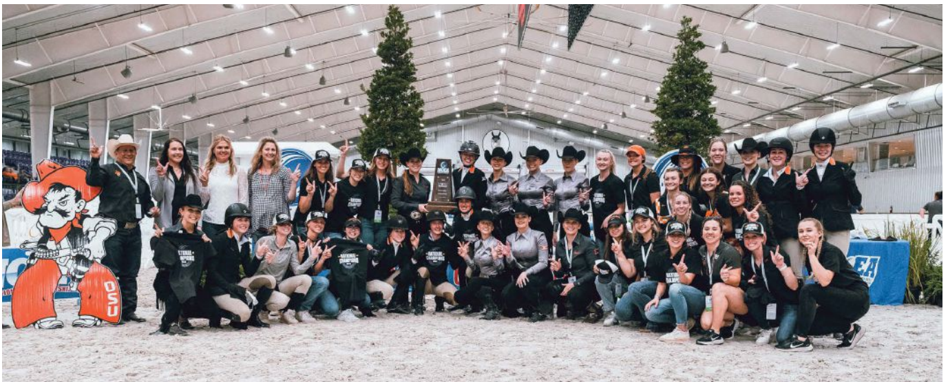
Oklahoma State University won the National Collegiate Equestrian Association Championship at World Equestrian Center—Ocala in Ocala, Fla.

While Oklahoma State University has won multiple national championships in western riding, the team had never won an overall National Collegiate Equestrian Association Championship. But this year, the Cowgirls showed they also had the English riding prowess necessary to take the overall title, defeating No. 3-ranked Texas A&M in the championship held April 14-16 at the World Equestrian Center—Ocala in Ocala, Florida.