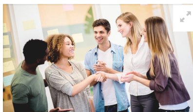
Group of entrepreneurs doing business and handshaking