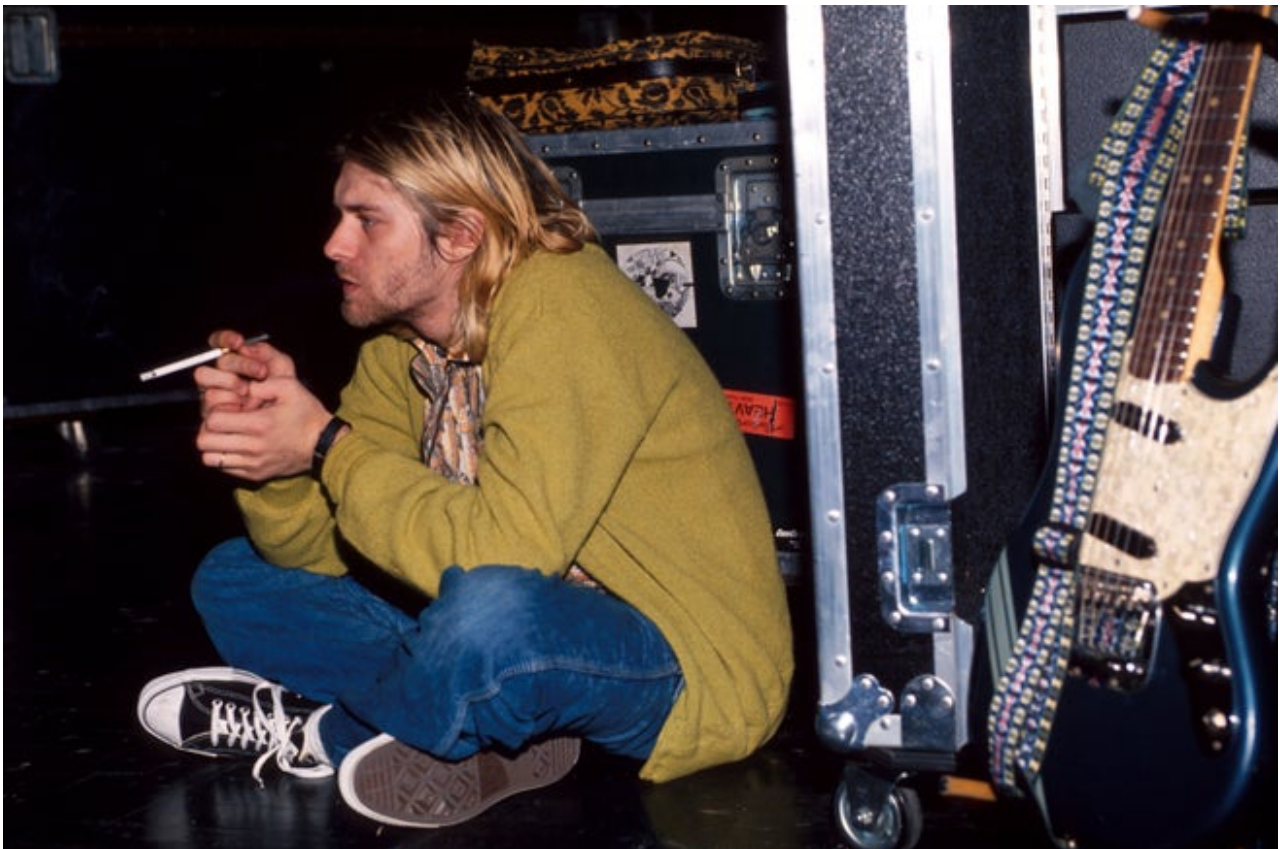
Kurt Cobain of Nirvana died by taking his own life in 1994.