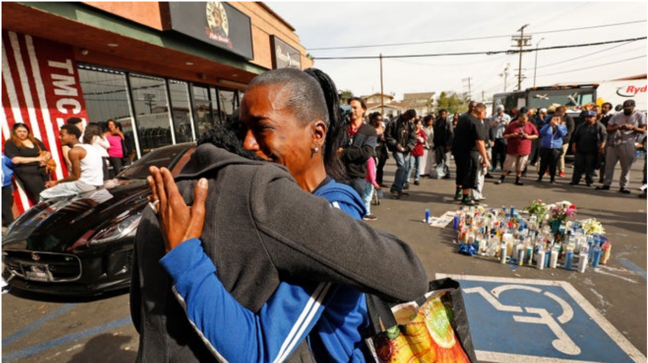
Fans grieve at the site of rapper and community activist Nipsey Hussle's murder.

READ MORE: Rapper Nipsey Hussle Shot Dead In Los Angeles