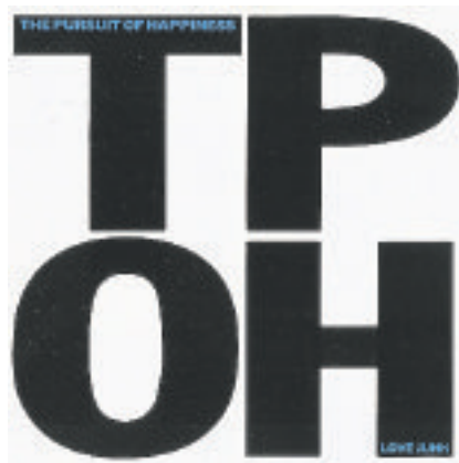
Album cover for The Pursuit of Happiness.

Now a self-starter, he needed more players. "I was just always into music, always wanted to be in a band ... so eventually I started one."