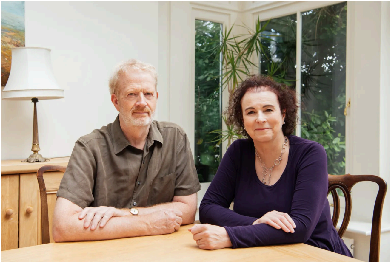
The Ritchies co-founded the charity Gambling with Lives following the death of their son Jack at the age of 24

The Government said these checks were much more "onerous" than what was being proposed, but campaigners said the industry used them to "drum up pushback" against the proposals.