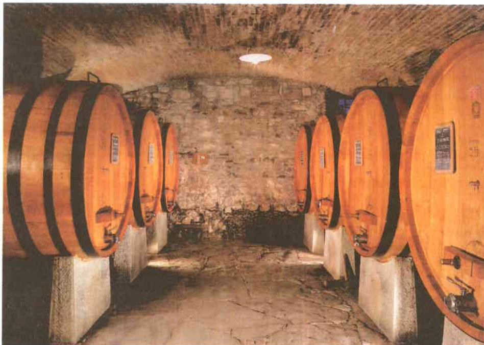
The pristine casks that line the cellar at Castello di Verrazzano sum up the traditionalist viewpoint at this prestigious estate: Never use barriques to age Chianti Classico because they make the wines uniform.

holding its own in the 2002 Chianti Classicos. While the vintage was one of the rainiest on record, the wines were surprisingly well balanced, even if slightly lighter bodied than usual. Those producers who have taken a step back from using barriques presented refreshingly unoaked wines compared to recent years. Overall, the Chianti Classicos had floral notes of violets and were predominantly an intense yet transparent ruby red, the natural color of sangiovese. In the very recent past, its luminous color penalized this varietal in the sense that many critics (and consumers) associate an inky, dark hue with high quality. There were also still quite a few wines whose typical nose of violets was masked by a strong vanilla essence and whose flavor profile showed aggressive wood tannins.