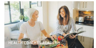
HEALTH COACHES ACADEMY

Are you fascinated with nutrition and using natural methods to stay healthy? Then consider a career as a health coach. Get qualified in less than a year with training at Health Coaches Academy. Visit healthcoachesacademy.com