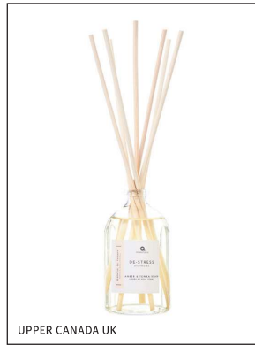
UPPER CANADA UK

Private medical centre Komao Medical specialises in hair transplant surgery, platelet rich plasma (PRP) scalp treatments, joint injections and facial treatments, as well as treatments for excessive sweating, migraines and teeth grinding. Get 25% off quoting BK2108Z at komaoo.org.uk , until 1 August 2022.