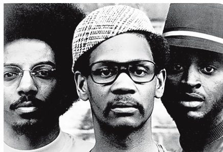
From left: Jalal Mansur Nuriddin, Abiodun Oyewole and Umar Bin Hassan in New York City circa 1971.

From its inception, however, the group had trouble maintaining its political agenda. Members argued over everything from whether to remain a trio or operate as a flexible musical unit — with different writers moving in and out of the lineup —