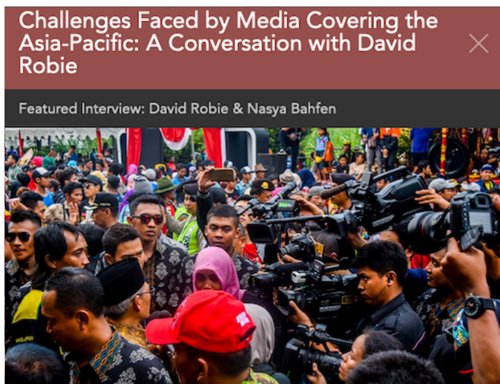
The Mediasia “conversation” on Asia-Pacific issues in Kyoto, Japan.

He was also convenor of the Pacific Media Watch media freedom collective, which collaborates with Reporters Without Borders in Paris, France.