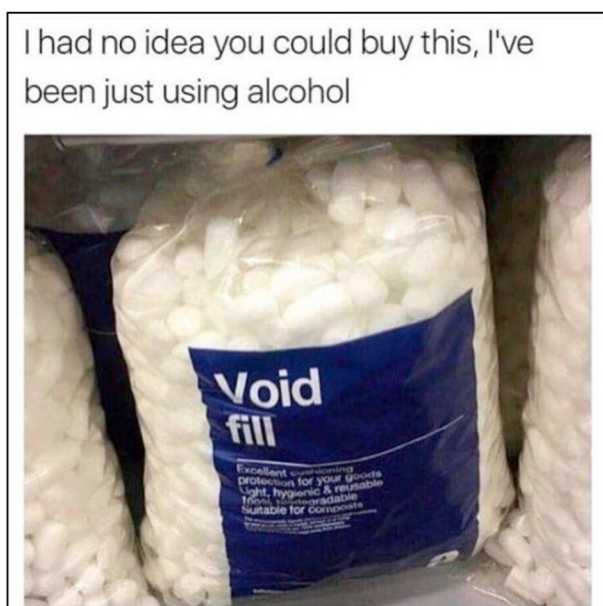
Fig. 1 Example of a mental health meme related to depression. Image gathered from the public domain each marked with either the Public Domain Mark 1.0 or CC0 1.0 Universal.

Members of the general population display increased positive emotional responses when observing humorous internet memes, relative to other forms of online media (Myrick et al., 2021). In the current context, a culmination of research highlights perceived benefits associated with online interaction with mental health memes (Akram et al., 2020; Drury, 2019; Gardener et al., 2021; Kariko and Anasih, 2019). Indeed, 47% of college students reported engaging with internet memes as a way of alleviating psychiatric symptoms (Kariko and Anasih, 2019). Here, contextual humour and relatability associated with dark and self-deprecating memes allowed individuals to laugh at their problems while forming a connection with others in the same situation.