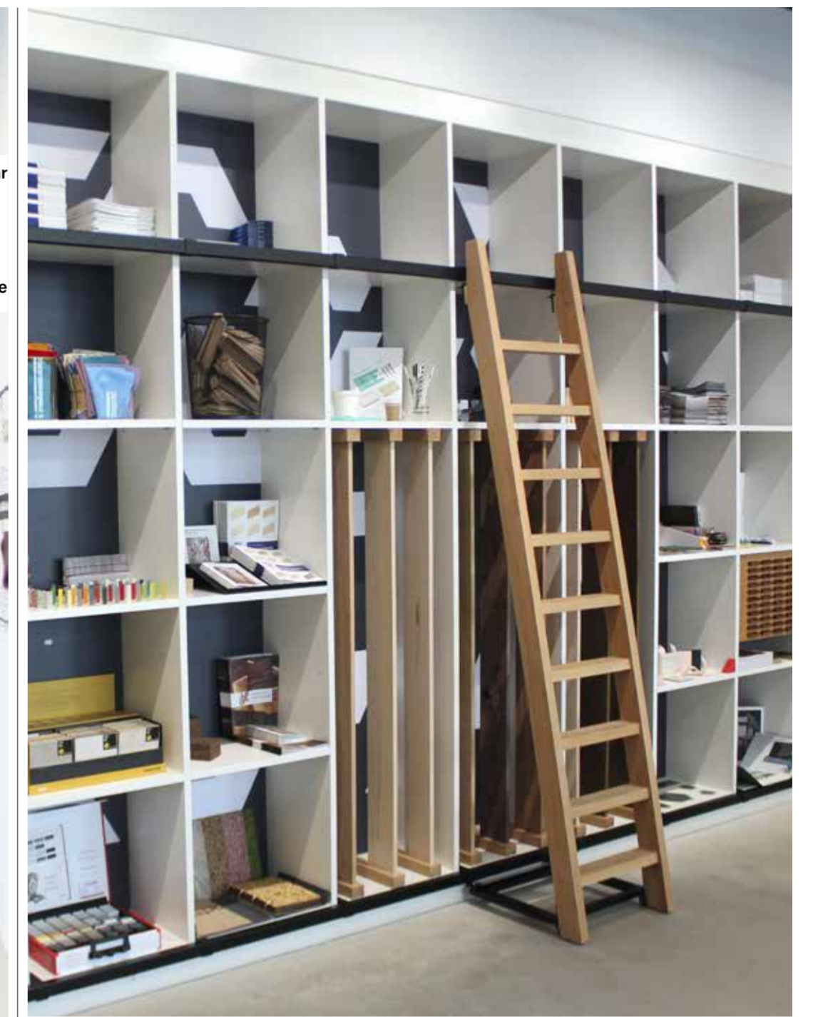
Colab is a social business venture that offers a material library, inspiration and learning centre

The design community has an important role to play in considering the environment, particularly with the development of technical innovations