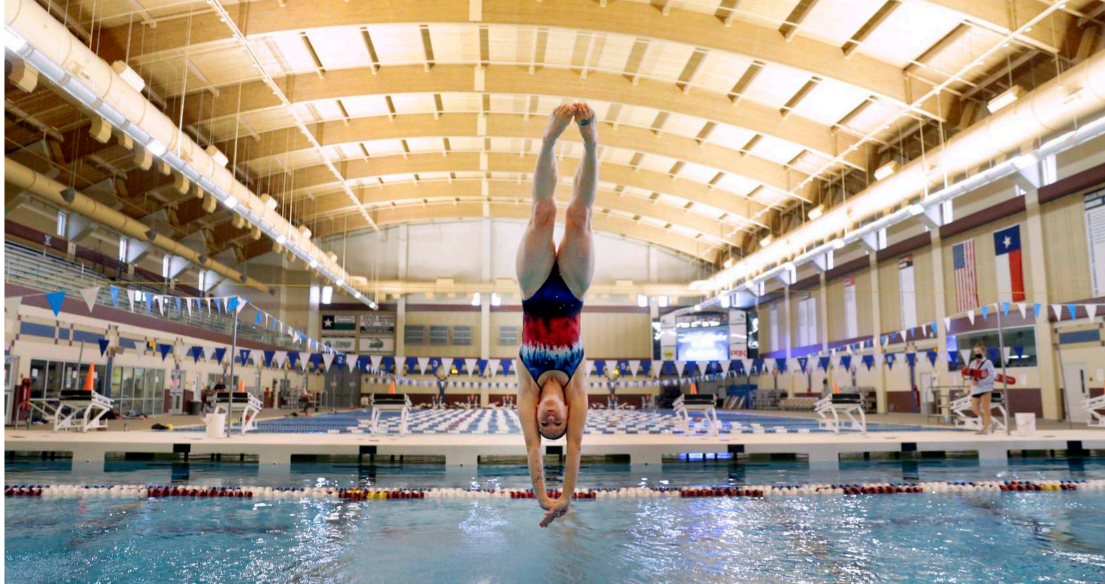
Laura Wilkinson, who won an Olympic gold medal in 2000, practices a series of dives at the Conroe Independent School District Natatorium. The 43-year-old diver is attempting an Olympic comeback after recovering from spinal surgery.

Mom of four Laura Wilkinson heals from major surgery — just in time to try and win a diving team spot for the Tokyo Olympics.