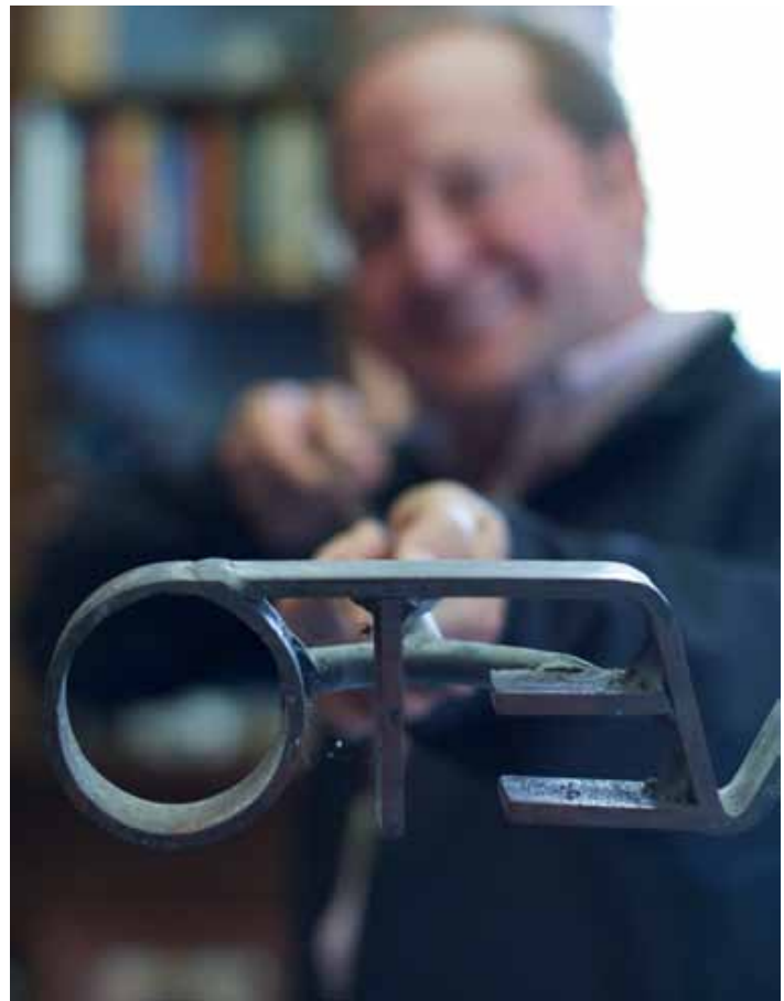
Schweitzer shows off his ‘veto’ branding iron.

“Who better,” he said. “Nobody loves this state more than I do.”