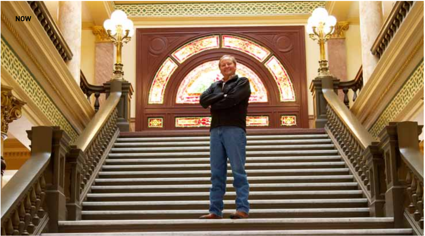
The governor in October 2012, on the grand staircase in the Capitol building.

MONTANA IS TRADITIONALLY A RED STATE. Until 2004, it hadn't elected a Democratic governor in two decades. The Treasure State has voted for just two Democratic presidential candidates since 1952.