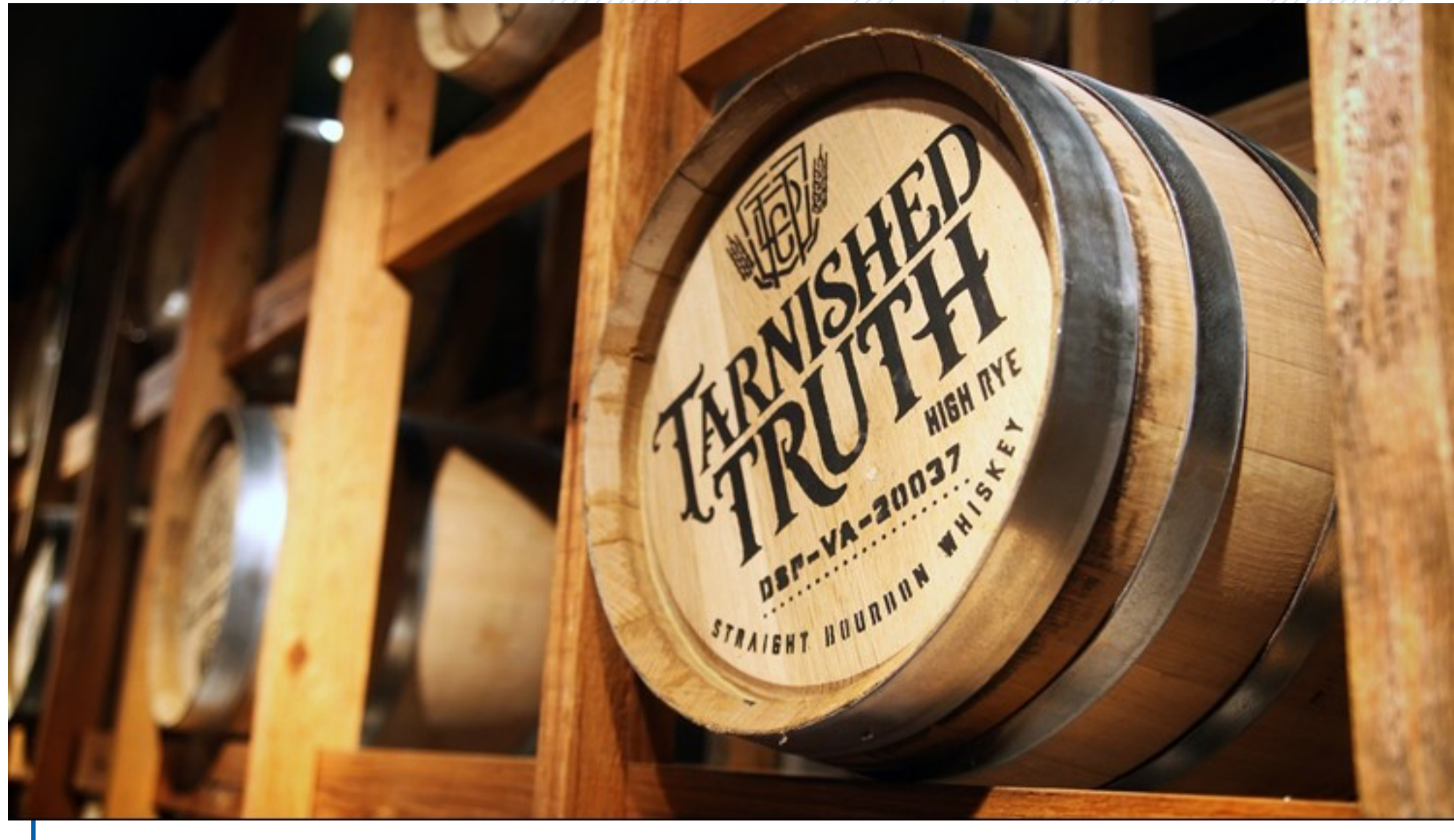
Tarnished Truth whiskey barrel.

Tarnished Truth Distillery Company is sending a message from Virginia Beach to Kentucky: Bourbon whiskey was born in Virginia (and Hampton Roads, at that).