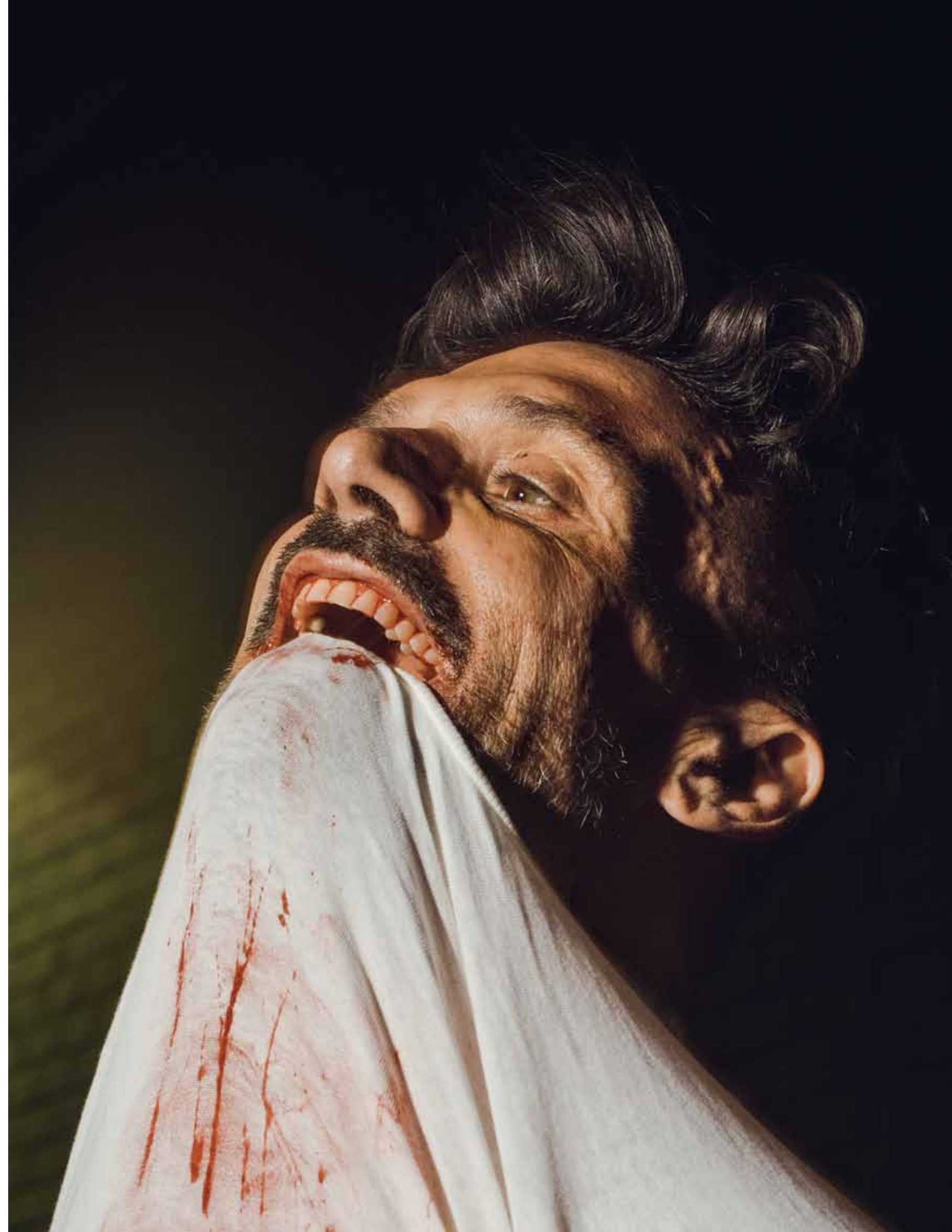
THIS SPREAD: WHITE T-SHIRT BY KELLY COLE, JEANS BY R13, VINTAGE GOLD CHAIN, VINTAGE BRASS KNUCKLES, BOOTS GRILLO'S OWN