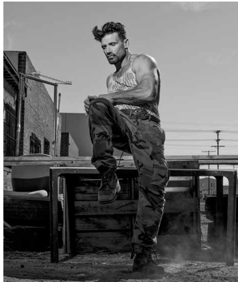
VINTAGE LEATHER TRENCH, VINTAGE TANK TOP, NECKLACE BY GUCCI, RINGS BY MCCOEN, BELT BY SSS WORLD CORP., PANTS AND BOOTS GRILLO'S OWN