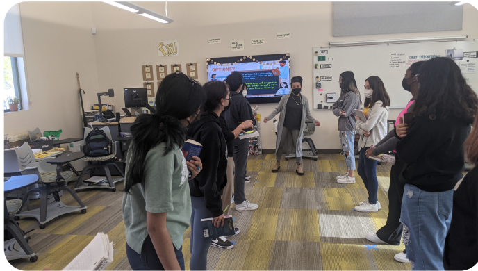
Students in Honors English preparing for College Presentations