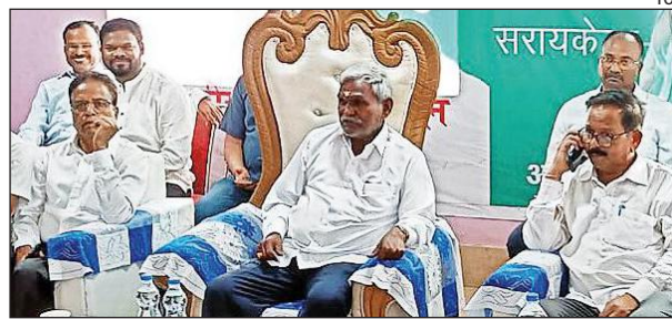
Chief minister Champai Soren chairs a meeting of JMM workers at a hotel in Adityapur on Saturday

Addressing the workers, the CM said, "Comprehensive information about the welfare schemes and the development programmes launched and implemented by the state govt should reach every household. Besides, the employment schemes should be conveyed to young voters." He cited the pension scheme for all, the 1932 Khatiyan policy, 75 per cent job reservation for locals in private organisations, and a housing scheme for economically weaker sections.