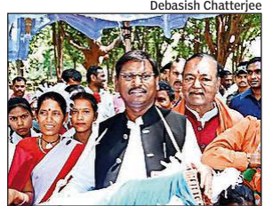
Arjun Munda during his campaign in Tamar on Saturday

The agriculture minister who has been on a whirlwind tour of his constituency everyday since his name was announced by the party in the first list visited Tamar, a place known for producing quality tomatoes. Talking to TOI, he said, "Modi is committed to developing each and every individual, especially the poor, downtrodden and women.