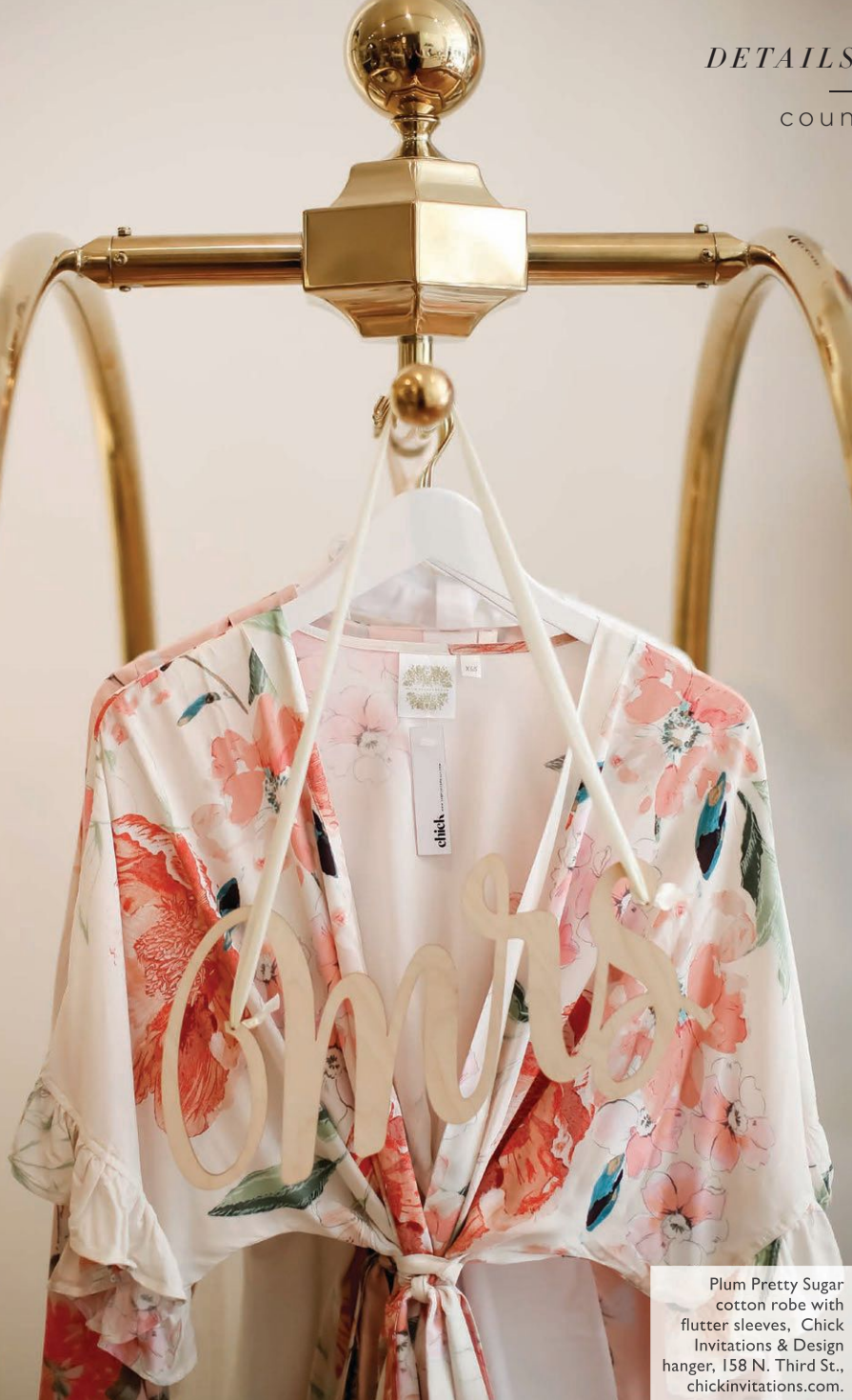
Plum Pretty Sugar cotton robe with flutter sleeves, Chick Invitations & Design hanger, 158 N. Third St., chickinvitations.com.