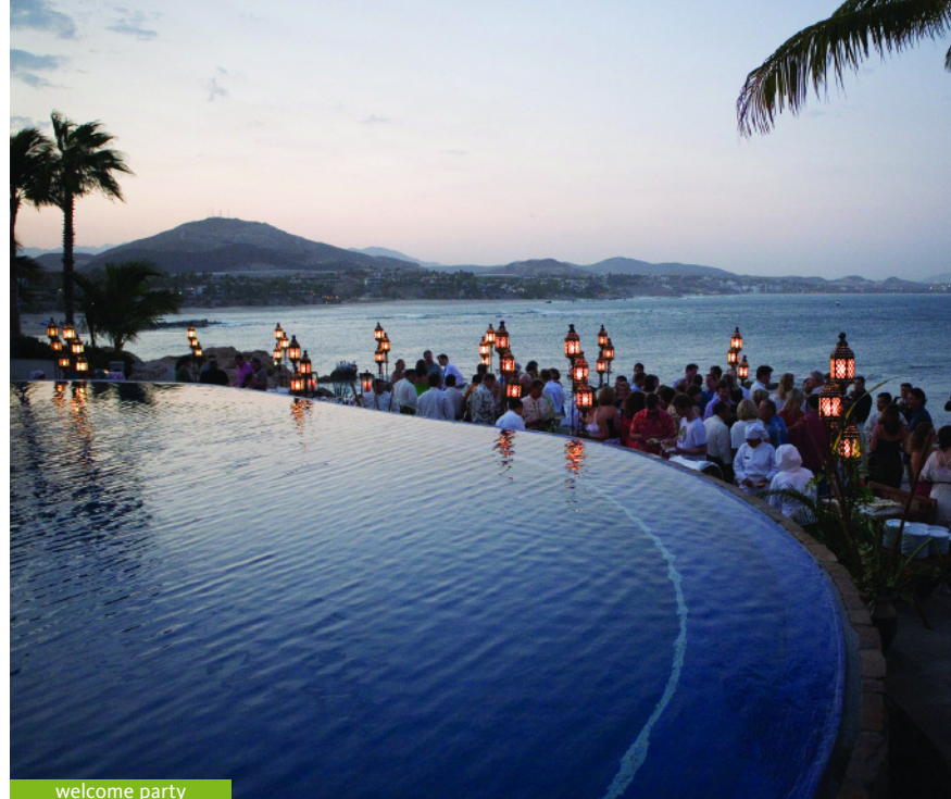
welcome party ceremony