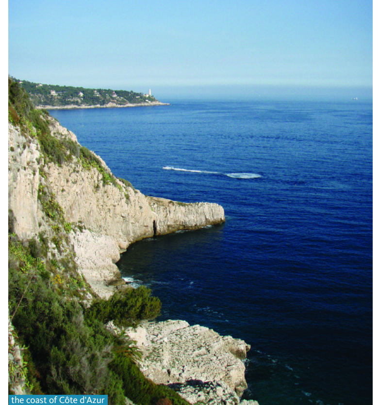
the coast of Côte d'Azur