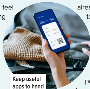
Keep useful apps to hand

GET ORGANISED You'll feel more relaxed by knowing you have taken care of everything you can control by placing all your important documents in a holder and downloading any apps you might want to use while away, such as audiobooks and travel guides. DISTRACT YOURSELF Guided meditations, breathing exercises and calming music can help keep you distracted on a flight. If you