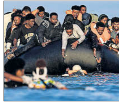
Crackdown plan... illegal migrants

Ms Badenoch has committed to taking the UK out of the European Convention on Human Rights – used to