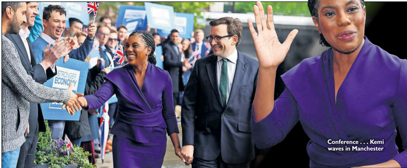
Conference... Kemi waves in Manchester

Iran blames Israel for stirring up unrest among an Arab minority in oil-rich Khuzestan province.