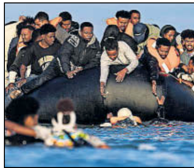
Crackdown plan... illegal migrants

Ms Badenoch has committed to taking the UK out of the European Convention on Human Rights – used to