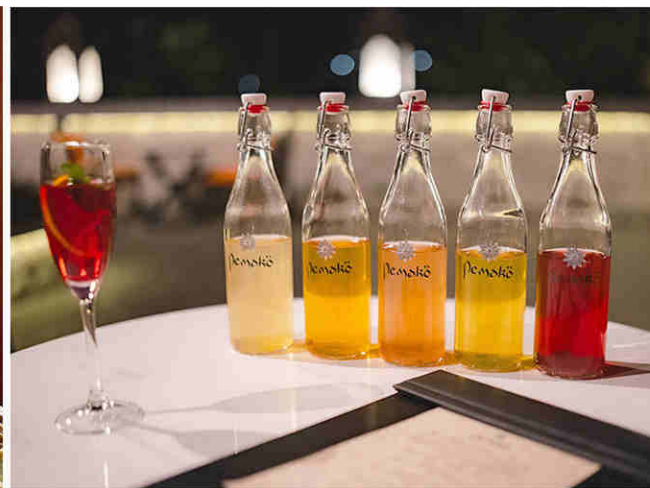
Across Asia, once-obscurer brews are slipping out of their clay jars and bamboo flasks, demanding global attention

bamboo flasks, demanding global attention. In Nagaland, zutho , a rice beer with a tart, cider-like kick, turns festivals into song. In the hill tracts of Myanmar, khaung yay , brewed from sticky rice and passed around in bamboo tubes, carries the warmth of community itself. From the Indonesian island of Flores, the potent palm spirit sopi fuels ceremonies with both fire and camaraderie. And in China's Guizhou province, the hauntingly fragrant mijiu of the Miao people—a sweet-sour rice wine steeped in wild herbs—remains a drink of ritual and rebellion.