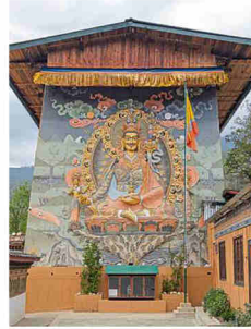
The Choki Art School.

The curiosity for art that underlies Bhutan's commitment to cultural preservation finds vivid expression in the country's art schools. Amongst them, the Choki Traditional Art School offers