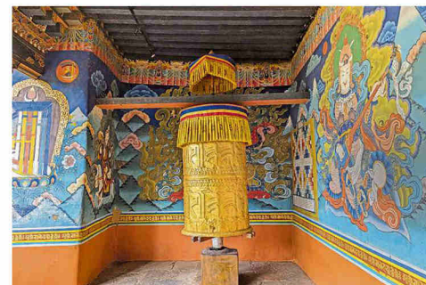
Wall paintings and prayer wheel at Punakha Dzong.

Their instruction spans disciplines such as lhadrî (painting), patra (woodcarving), tshemdrup (embroidery), thagzo (weaving), and tshemzo (tailoring).