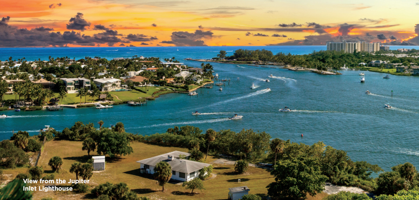
View from the Jupiter Inlet Lighthouse

At these off-the-beaten-path winter vacation destinations, you'll find unique