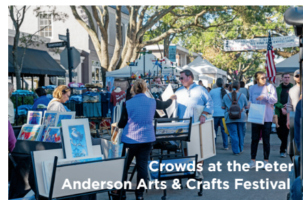
Crowds at the Peter Anderson Arts & Crafts Festival

Don't miss: Learn about sea turtles and participate in their recovery at the nearby Loggerhead Marinelife Center in Juno Beach. It includes an outdoor "hospital," several aquariums and a beach from which healthy turtles return to the ocean.