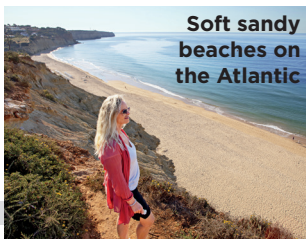
Soft sandy beaches on the Atlantic

Beyond Tavira, travelers will discover small beachside towns, islands accessible by ferries and superlative seafood, Ball notes. Because the majority of the Algarve's visitors come in the summer, winter travelers will have fewer hotel and restaurant options, but those that are open year-round are frequented by locals. "Portugal is absolutely wonderful for hospitality," Ball says. "The people are unique and friendly, and they love to share their culture."