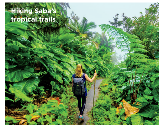
Hiking Saba's tropical trails

Don't miss: Dive spot Man O'War Shoals stands out for its vibrant sea life: sponges, black coral and lobsters.