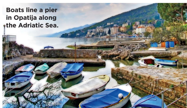
Boats line a pier in Opatija along the Adriatic Sea.

lar.” Stroll the Lungomare, a roughly 7-mile promenade connecting Opatija with other coastal fishing villages. Completed in 1911, the Lungomare represents Opatija’s renown as a late-19th-century retreat as it traverses lush groves of holm oaks and laurel. Throughout the year, the oils from magnolia and laurel trees perfume the air, says Radetti. Croatian pastry shops abound, and in the winter, oysters are a local specialty. In addition to the natural and man-made beauty, winter visitors to Opatija—and Croatia in general—will be astonished by the light reflecting off the water and cliffs. “We call it ‘illumination,’ and it is absolutely beautiful,” Radetti says. Although Croatia has seen an uptick in tourism in recent years, the numbers still lag behind other European destinations, which means that winter visitors will have ample opportunity to experience authentic Croatian hospitality.