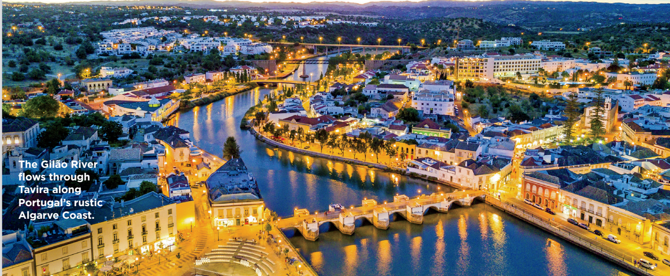
The Gilão River flows through Tavira along Portugal's rustic Algarve Coast.

Winter trips across the Atlantic often lead you to holiday markets, skiing and taking in the northern lights on the continent's upper reaches. But travelers looking for warmer weather and uncrowded escapes can find those too. Be sure to pack a sweater, though; in southern Europe, even mild climates can have a chilly day. By Rachel Walker