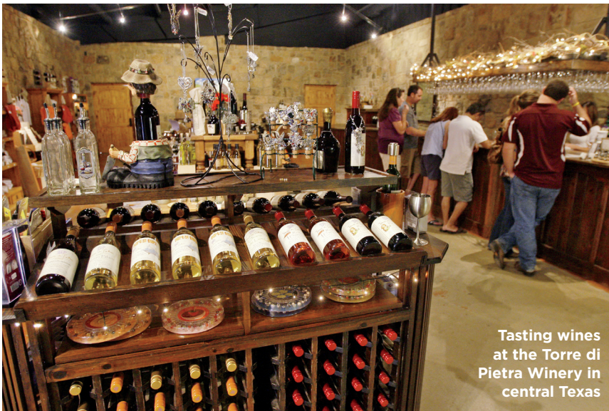
Tasting wines at the Torre di Pietra Winery in central Texas