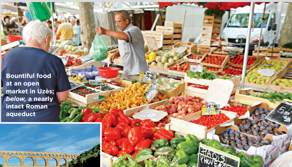
Bountiful food at an open market in Uzès; below, a nearly intact Roman aqueduct