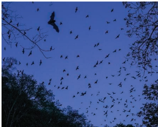
The "bat volcano," a cave from which millions of bats emerge every evening at dusk, was threatened by the Maya Train until it was rerouted.