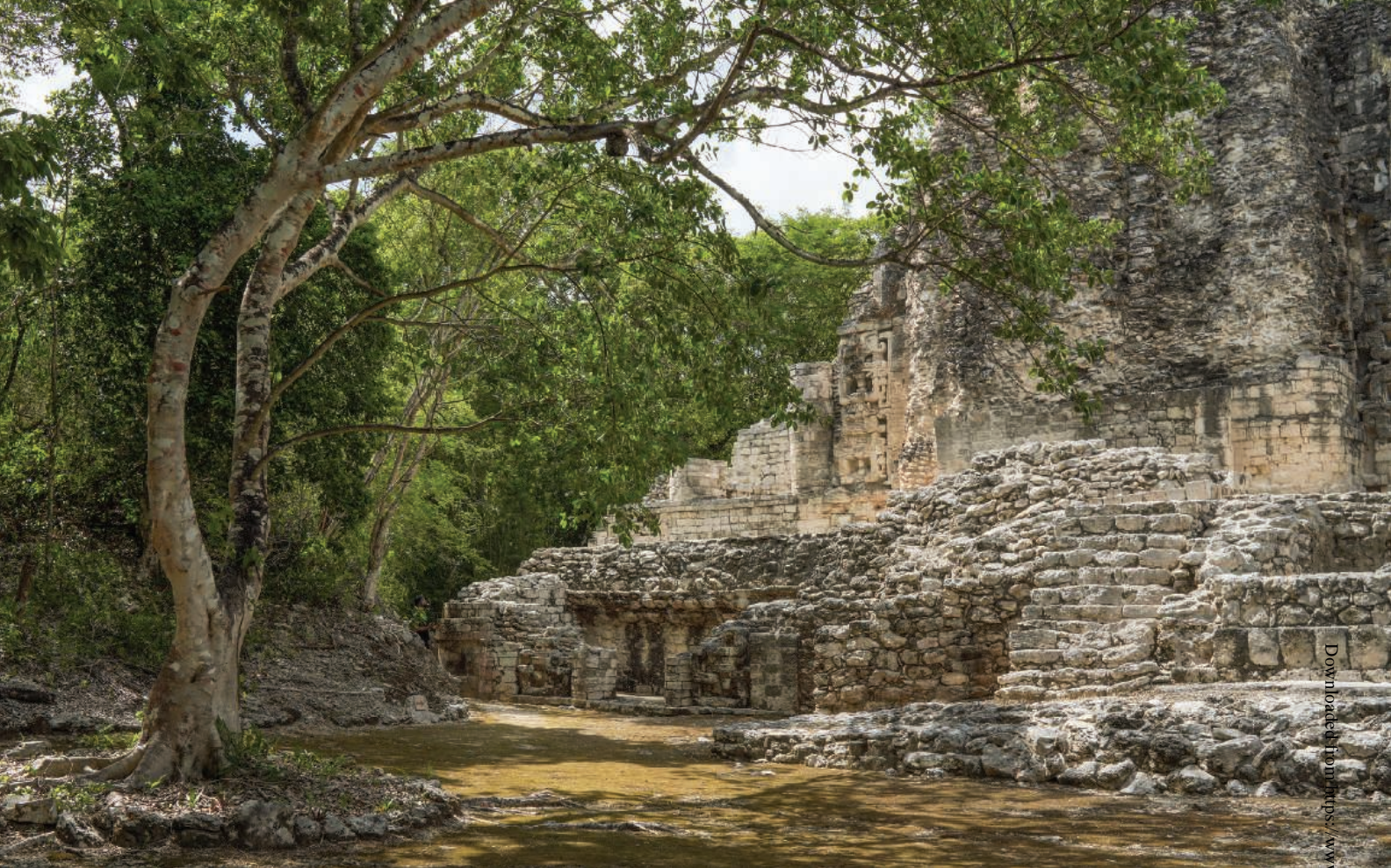
Ancient Maya temples, like this one at a site called El Hormiguero, are perfect roosts for bats, providing shelter, warmth, and darkness.

since trained five other jaguars to avoid cattle, goats, and sheep.