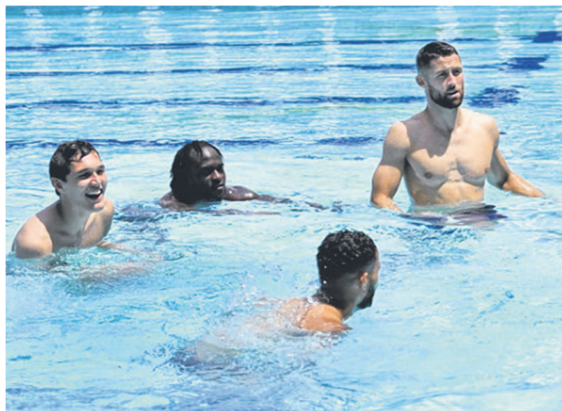
The Blues chilling out after training.