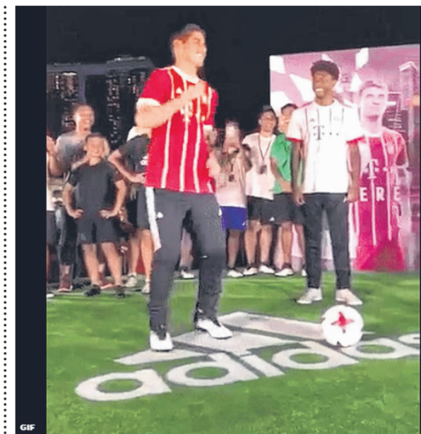
Bayern new boy James Rodriguez does a jig at the adidas Football Freestyle Battle.