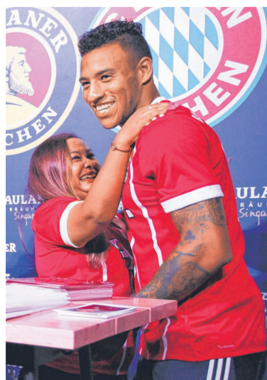
A fan embracing Bayern Munich midfielder Corentin Tolisso during a meet-and-greet session at German restaurant Paulaner Brauhaus. The French international has a tough task ahead to secure a starting berth.

New club record signing Alvaro Morata vying with Victor Moses during Chelsea's training session at the National Stadium yesterday. The Spaniard will be their first-choice striker this season.