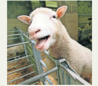
EWWE WHAT... cloned Dolly