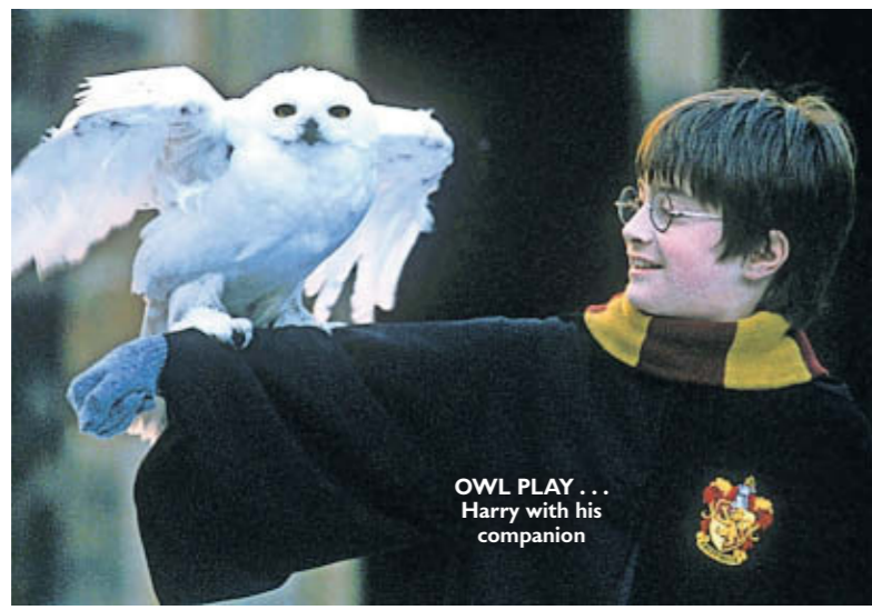
OWL PLAY... Harry with his companion