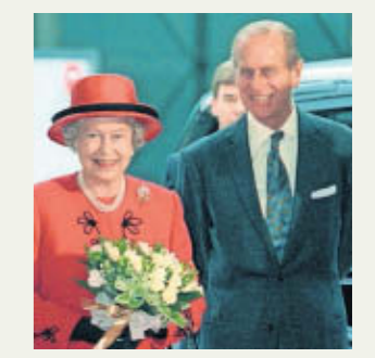
MILESTONE... Queen and Philip