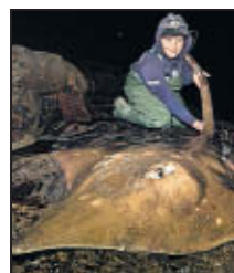
Harley... with catch