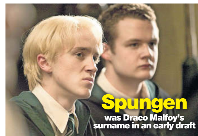
Spungen was Draco Malfoy's surname in an early draft