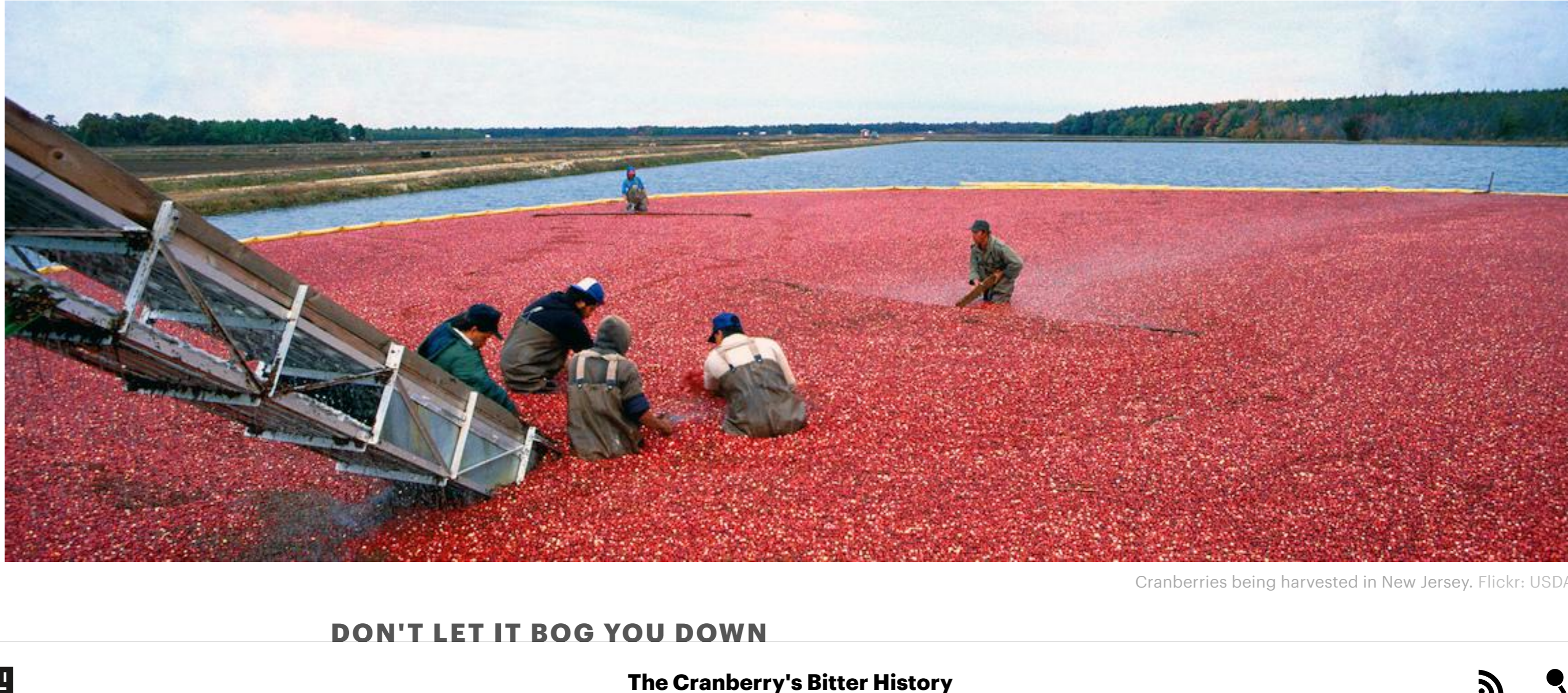
Cranberries being harvested in New Jersey.