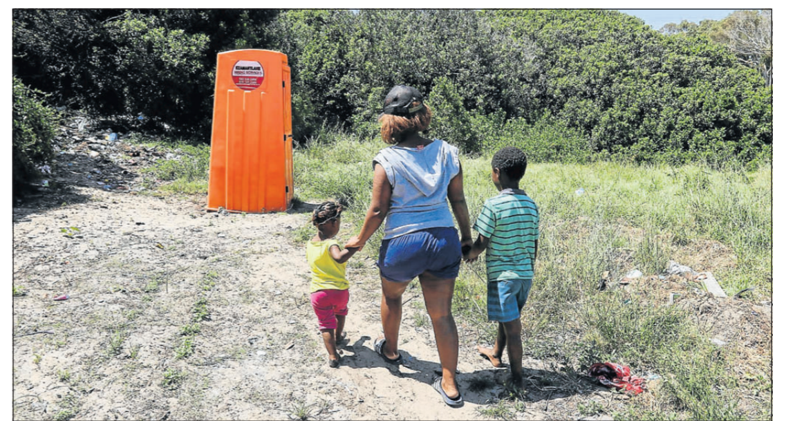
PLASTIC ALTERNATIVE: A family makes their way to one of the chemical toilets in Seaview

Residents complained that the toilets were not cleaned at regular intervals and that at times, cleaners simply dumped the faeces in the neighbourhood.