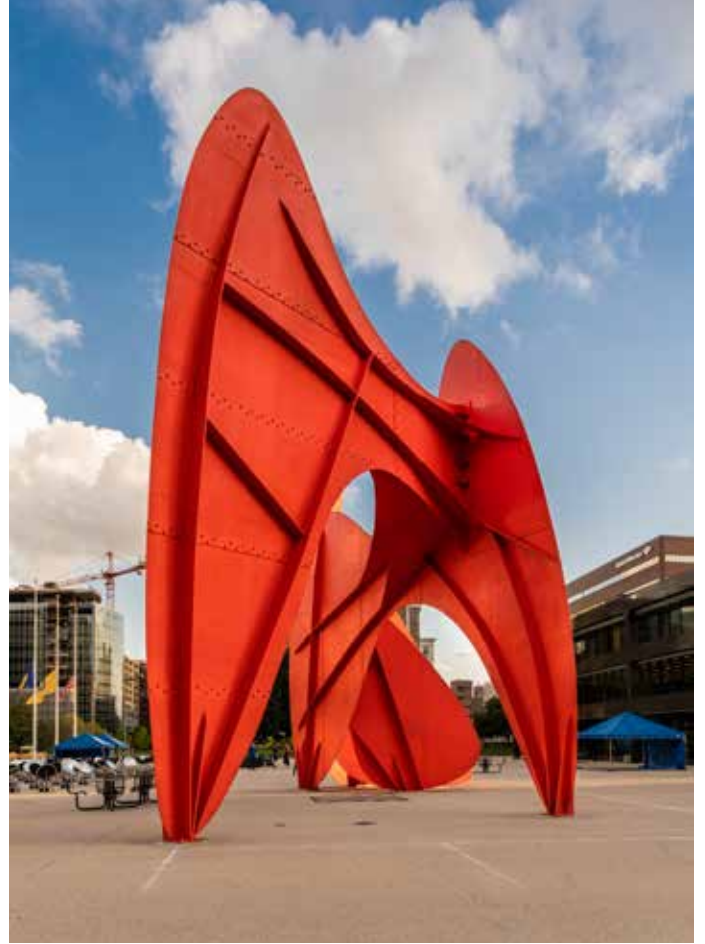
La Grande Vitesse at Calder Plaza