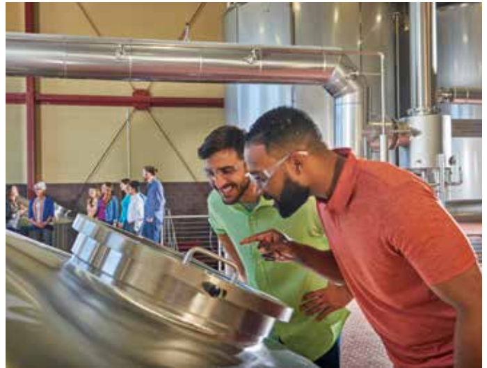
Visitors get a closer look at the brewing process on the Founders Brewing Co. tour.

lifetime and has displays of some of the former first lady's famous gowns and dresses.