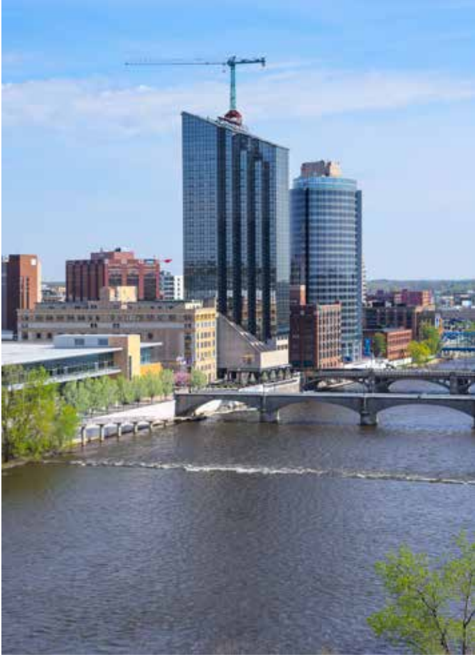
The Grand Rapids skyline with Amway Grand Plaza Hotel