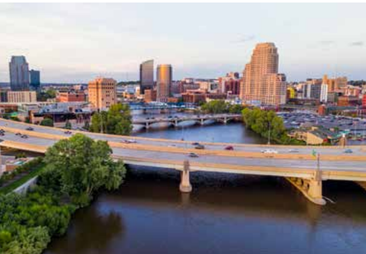
The Grand Rapids skyline