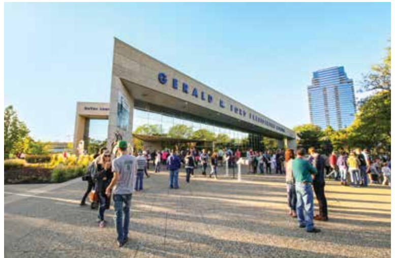
Gerald R. Ford Presidential Museum