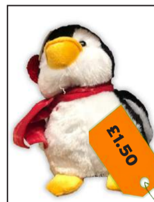
HIGH STREET: We found similar items to Harrods by shopping around on Twickenham High Street - and they were 230 times cheaper too!