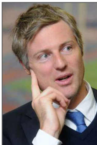
ZAC: 'Stop brutal trade'

While our version may not have the "soft plush fur", "synthetic filling" and "pure mohair" that its alternative arrogantly boasts, we reckon it's more than enough to make a child smile this Christmas.