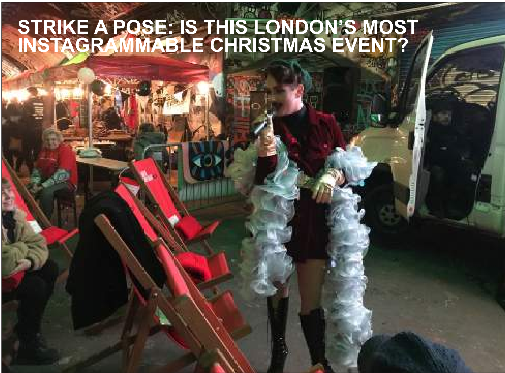
PICTURE PERFECT: Last night Waterloo's iconic arches were transformed into a glittering snow-lined Christmas scene for Miracle on Leake Street.