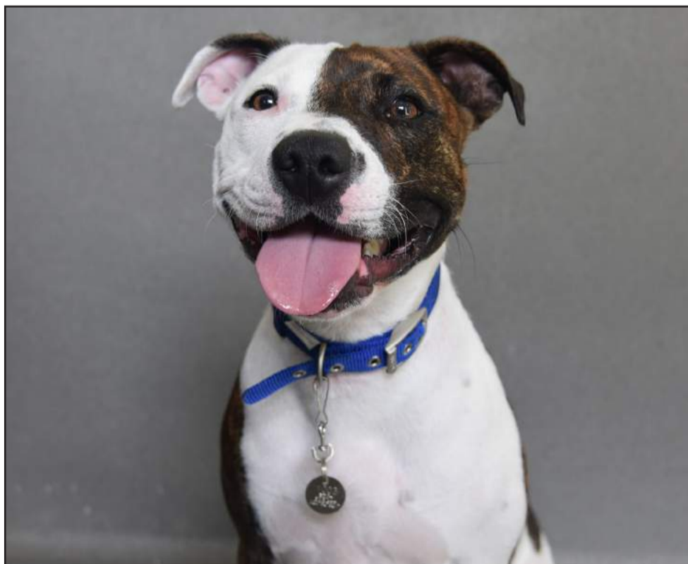
THIRD TIME LUCKY: Clever Cookie has a new job and home thanks to her nose for trouble

On passing her January assessment she will begin work detecting drugs at prisons across the country.