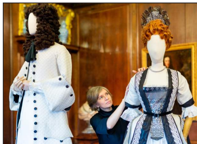
REGAL: Olivia Colman's costumes as Queen Anne on display

The costume display at Kensington Palace runs until 8 February 2019.