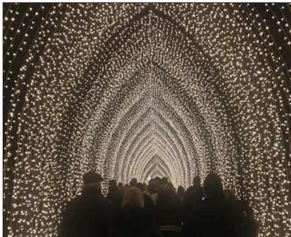
LIGHTS, KEW, ACTION: Kew Gardens Christmas lights attract crowds

The case will last for two weeks in March 2019 at the High Court.