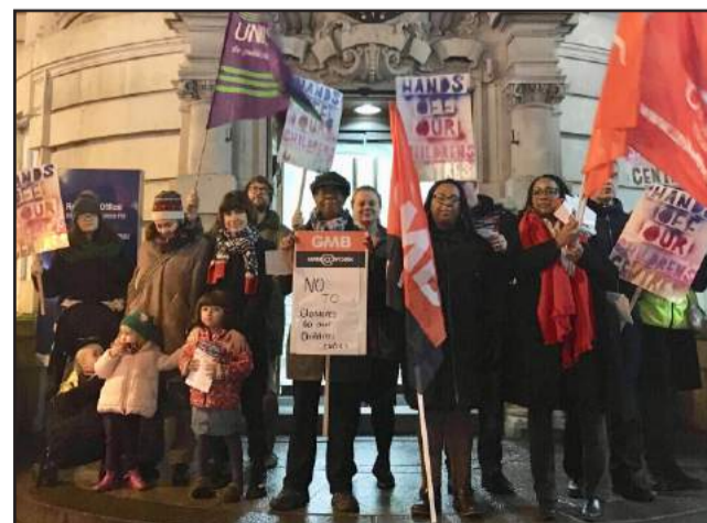
HANDS OFF OUR CENTRES: Mums protest council closures

"This is a tough decision but one we have made based on the centre's location and accessibility for parents, among other factors."