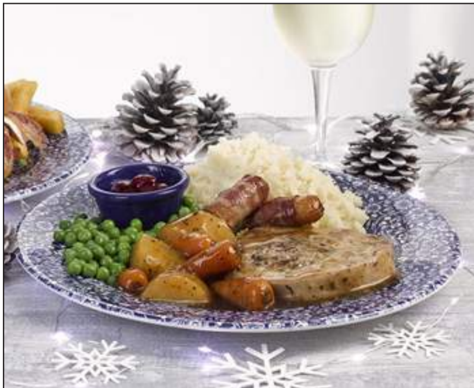
PUB GRUB: Wetherspoons 2018 Christmas dinner featuring chicken stuffing burgers

The Ministry of Justice refused to comment.