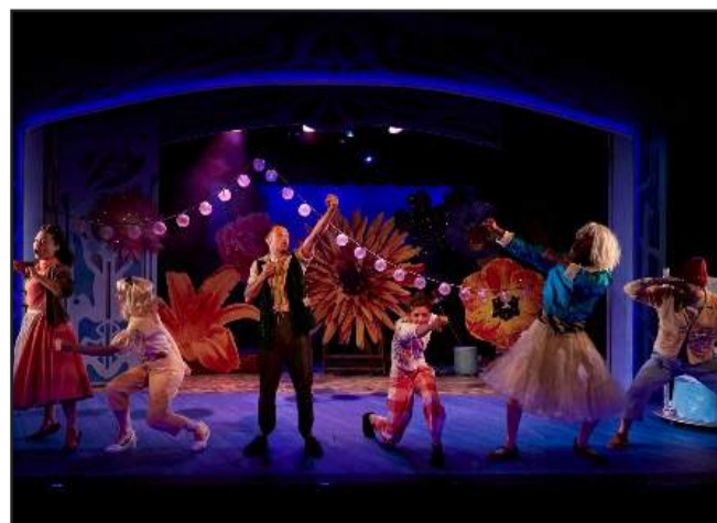
ACE ACT: Polka attracts more than 90,000 visitors a year