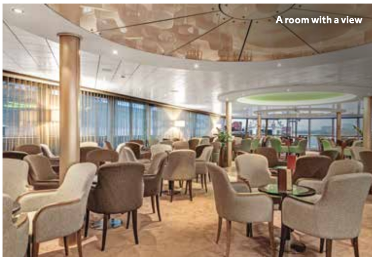
A room with a view

on arrival, it's by no means set in stone so moving elsewhere if you make friends with someone at another table is unlikely to raise any eyebrows. It's nice how the head chef and his galley team come out to welcome diners, and I love how the waiting staff – who wear protective face masks – have name badges with their photos on so that we can get to know the face behind the mask. A nice touch, not to mention a very effective ice-breaker.