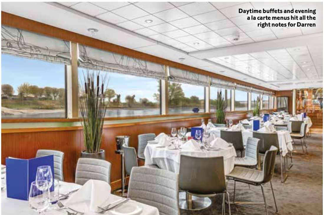
Daytime buffets and evening a la carte menus hit all the right notes for Darren

the roomy sun deck. Being able to get out "on top" as we drift under Arnhem's landmark John Frost Bridge (the actual 'Bridge Too Far') is quite a moment for me. Gazing down to watch our 11.4m-wide vessel pass through some of the River Lech's 12m-wide locks is a highlight, too! »