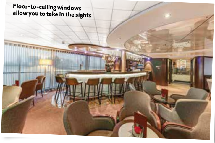
Floor-to-ceiling windows allow you to take in the sights

always popular, as is the much-loved and universally well-attended ritual of afternoon tea. Evening entertainment varies, with quizzes and musical acts topping the bill most nights. Passengers who're keen to pair their sightseeing with an al fresco drink and some fresh air can head up onto