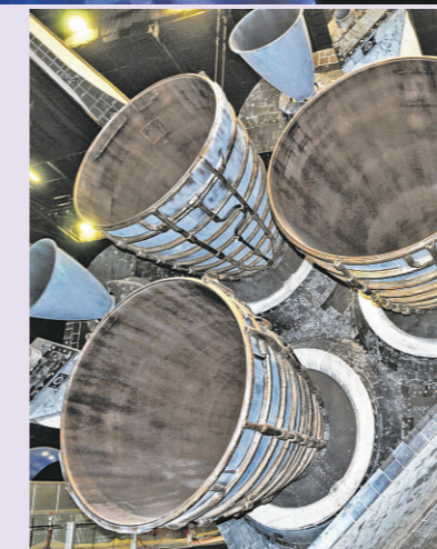
At Kennedy Space Center Visitor Complex, construction crews have just completed the $100 million, 90,000-square-foot facility that showcases the space shuttle Atlantis.