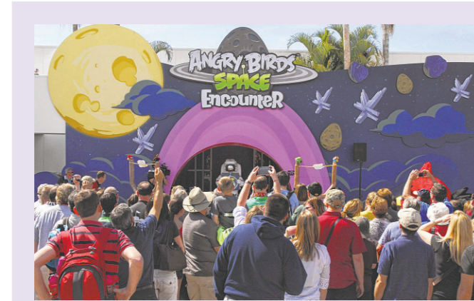
In the Angry Birds Space Encounter at Kennedy Space Center Visitor Complex, guests have the opportunity to experience seven interactive exhibits.

Through logistical and engineering feats, the shuttle was tilted at a 43-degree angle with her payload doors open. Visitors can walk under, around or "nose level" to the massive craft. During the planning phase, thousands of pictures were taken. Those images later helped organizers choose the blueprint for how Atlantis would be displayed — the view an astronaut would get as he or she