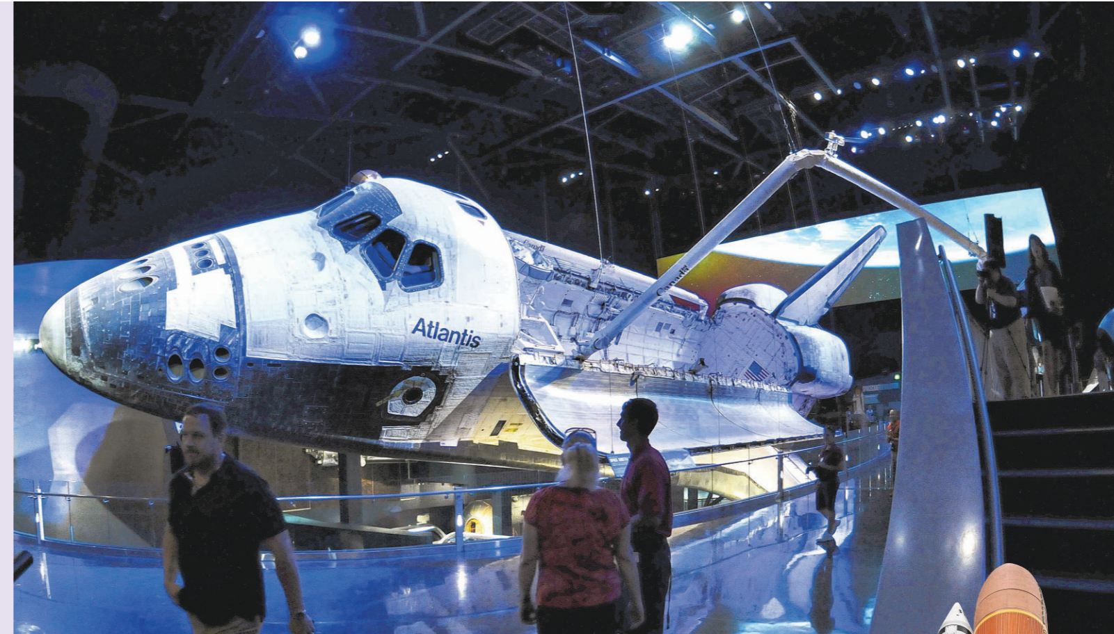
Atlantis is tilted with its payload bay doors open.

» Astronaut Training Experience: KSC's ATX program takes you through a shuttle mission simulation, astronaut training exercises and hands-on space exploration activities at the U.S. Astronaut Hall of Fame. Reservations required for the half-day program. Cost is $145 for those 14 and older. ATX family prices are $175 for those 12 and older, $165 for ages 7 to 11.