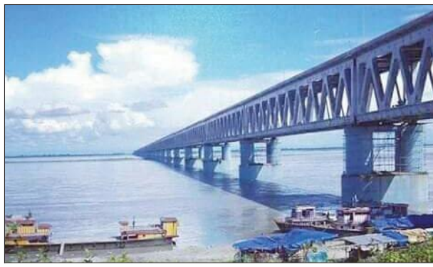
The Bogibeel bridge is the longest rail-cum-road bridge of the country

Dibrugarh: Preparations are on full swing at Kareng Bali ghat, where Prime Minister Narendra Modi will inaugurate the Bogibeel bridge on December 25.