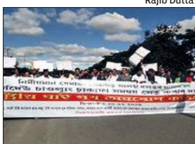
Ahom organizations protest in Dibrugarh on Thursday

The Ahom community has been demanding that the Bogibeel bridge be named as 'Swargadeo Chaolung Sukapha Swamanyu Setu' after the first Ahom king, Chaolung Sukapha. Chaolung Sukapha (1228-1268), also pronounced Sju-Ka-Pha, was the first Ahom king in medieval Assam and was the founder of the Ahom kingdom. A Tai prince originally from Mong