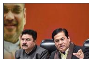
Chief minister Sarbananda Sonowal at the BJP headquarters in Delhi on Thursday

Sonowal said that Congress, which had 270 ZPs in 2013 but won just 147 this time, has been punished for looting