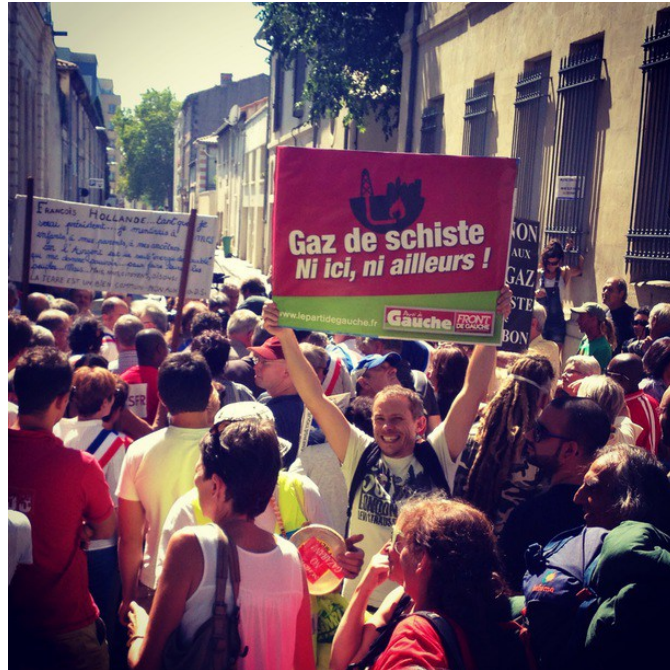
"Ni ici, ni ailleurs"