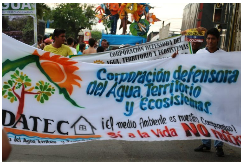
Corporación Defensora del Agua, Territorio y Ecosistemas (CORDATEC), Colombia

for protecting their lands and water from the likes of Exxon Mobil and Total. In 2015 Mapuche woman, Relmu Ñamku (https://democracyctr.org/article/how-extreme-energy-leads-to-extreme-politics/), was sentenced with attempted murder after a police officer was hit with a stone as forces attempted to break up a community-held blockade. These charges, which were later dropped owing to international pressure, formed part of Argentina’s anti-terrorism law.