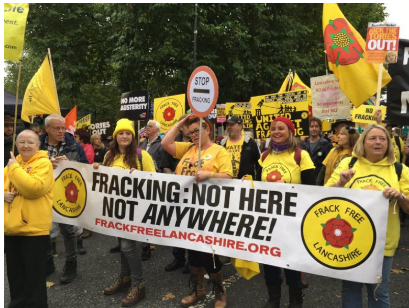
Frackfree Lancashire

How Ireland Banned Fracking - The Importance of Connecting Across Struggles https://democracyctr.org/resource/analysing-the-irish-fracking-campaign/