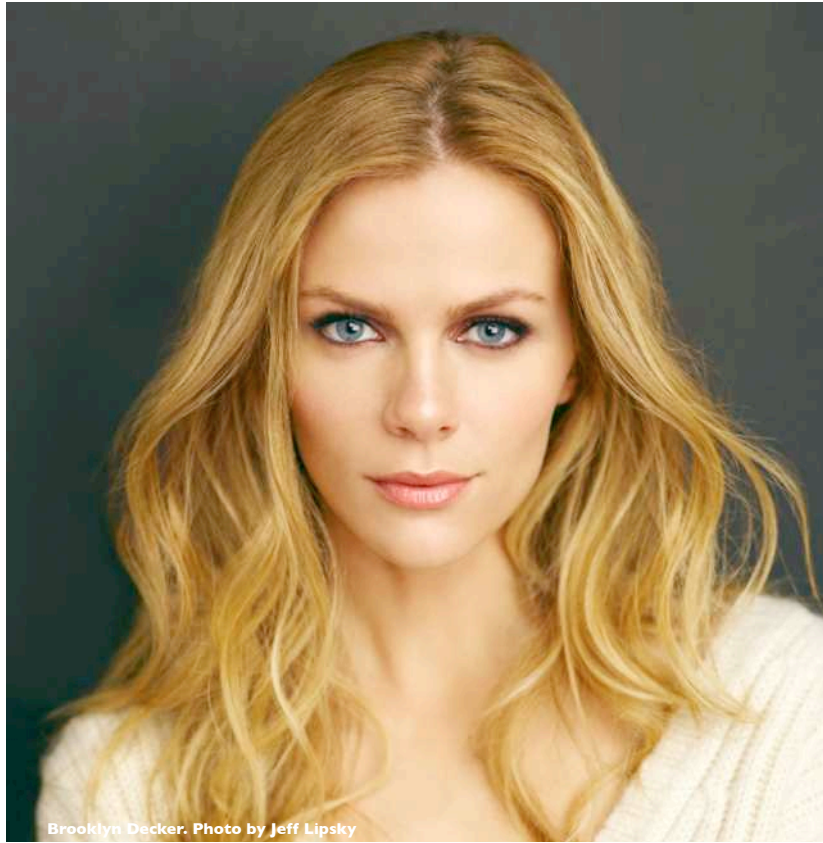
Brooklyn Decker.