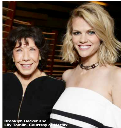
Brooklyn Decker and Lily Tomlin.