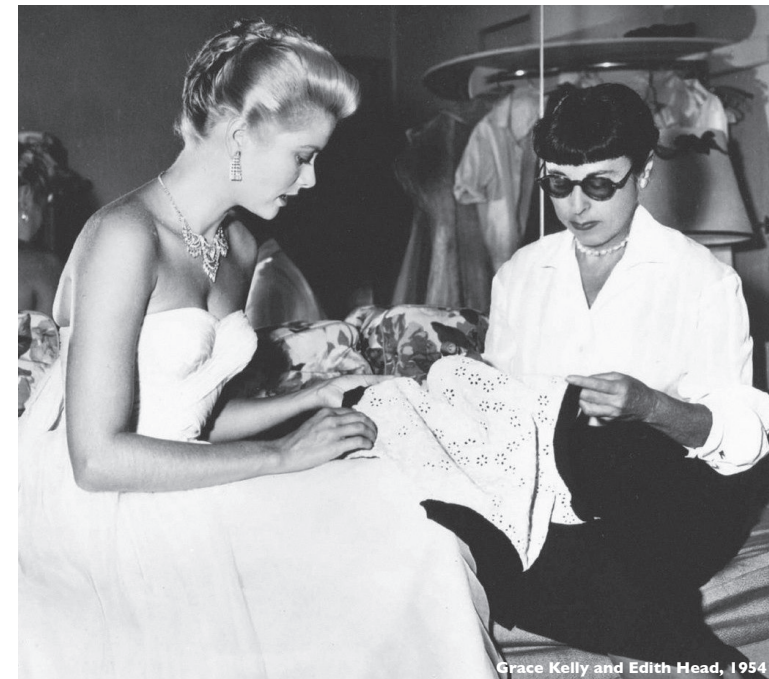
Grace Kelly and Edith Head, 1954