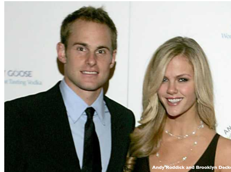
Andy Roddick and Brooklyn Decker

Book that left a lasting impression on me was... Hillbilly Elegy by J.D.Vance. It takes place where I was born and where my mom and a huge chunk of my family are from. It helped me to understand them on a deeper level.