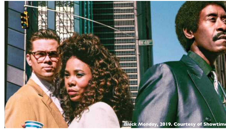
Black Monday, 2019.