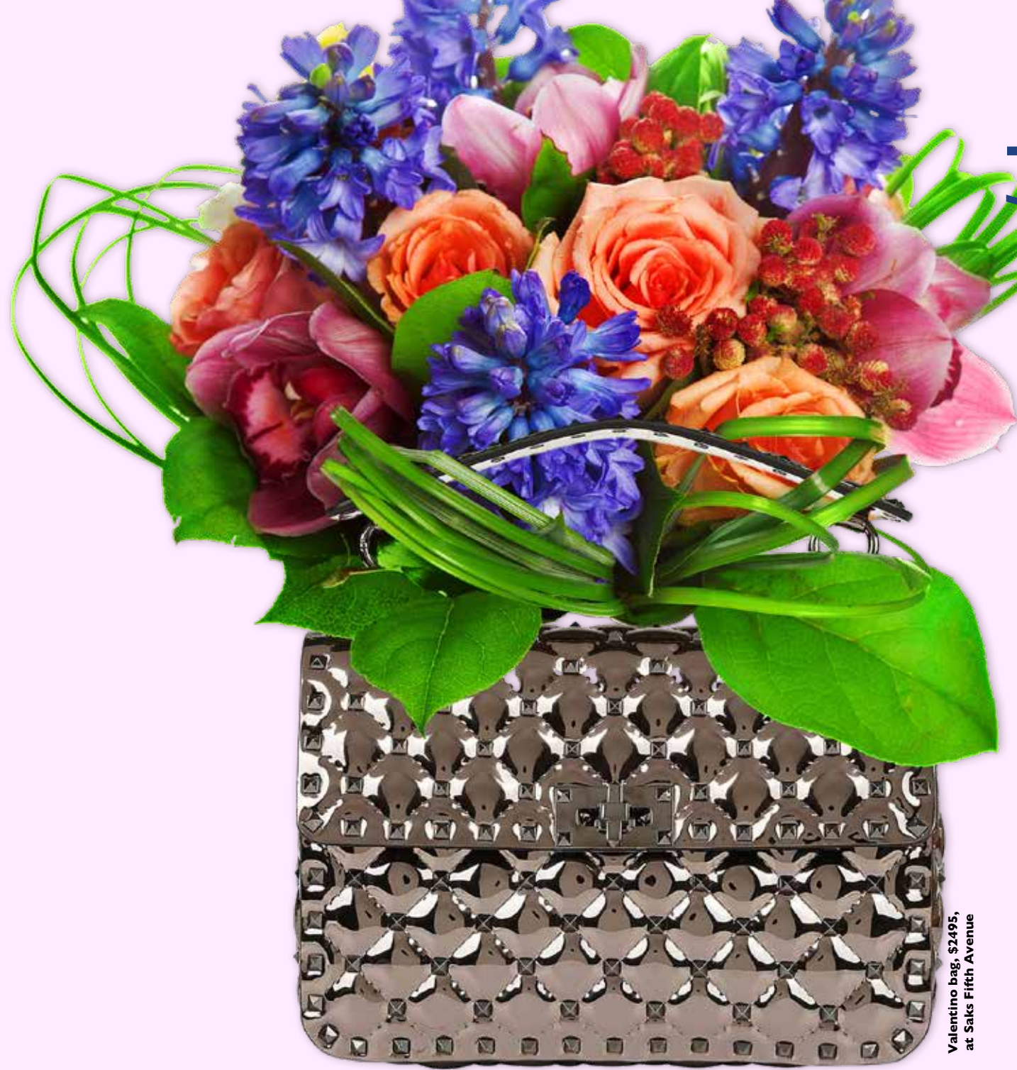
Valentino bag, $2495, at Saks Fifth Avenue