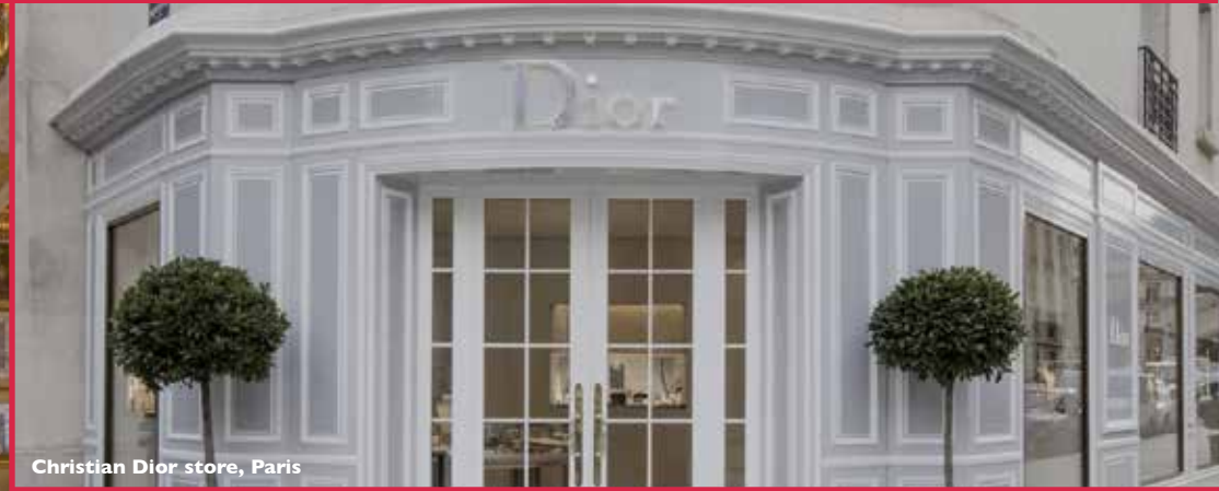
Christian Dior store, Paris