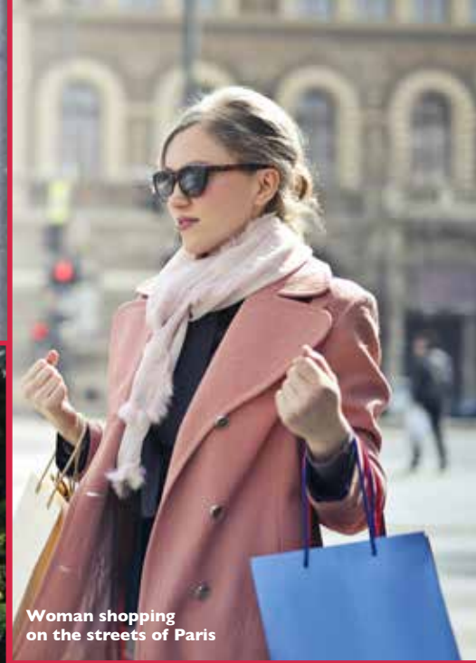
Woman shopping on the streets of Paris