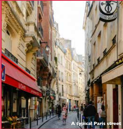
A typical Paris street