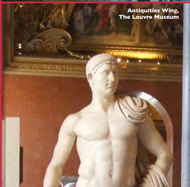
Antiquities Wing, The Louvre Museum