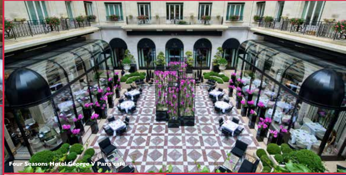
Four Seasons Hotel George V Paris cafe