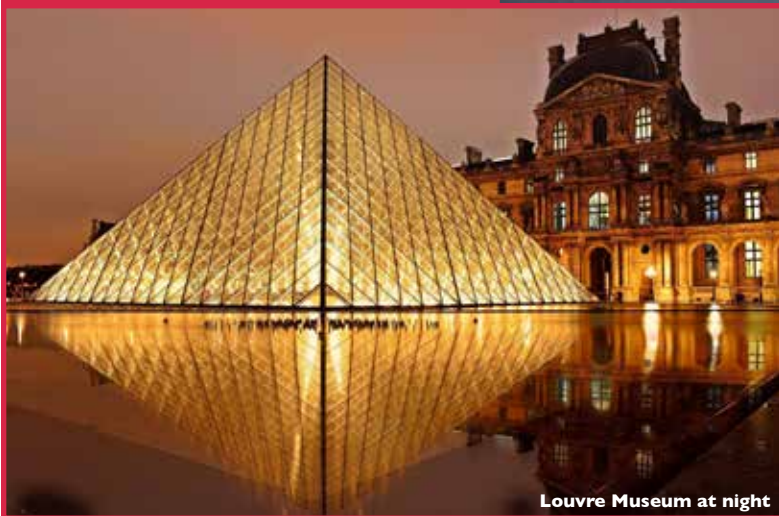
Louvre Museum at night