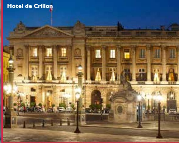
Hotel de Crillon