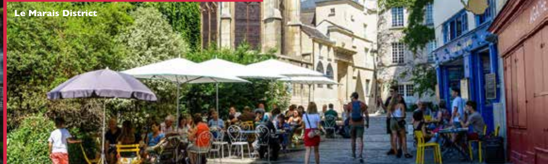
Le Marais District

“Going out at night is just as glamorous an endeavor. To start the evening, why not pop in for an aperitif at the Experimental Cocktail Bar where they serve excellent drinks, go to the theater and finish with a late dinner in one of my favorite restaurants, perhaps at Hotel Costes? Then, stroll along the Seine river to look at the most beautiful city of the world: the Eiffel Tower, the Grand Palais, Alexander III bridge, the Louvre, the Orsay Museum, and Notre-Dame. Other notable areas I discovered in Paris, through insider recommendations, include Le Marais, Saint-Sulpice, Avenues Montaigne and Saint-Honore, Sevres-Babylone, Place des Victoires, Les Halles and Saint-Michel—all sublime French experiences. Interesting to note, nobody really shops on the Champs-Elysees, unless they want to find the quintessence at the same boxy chain stores easily found at home.”