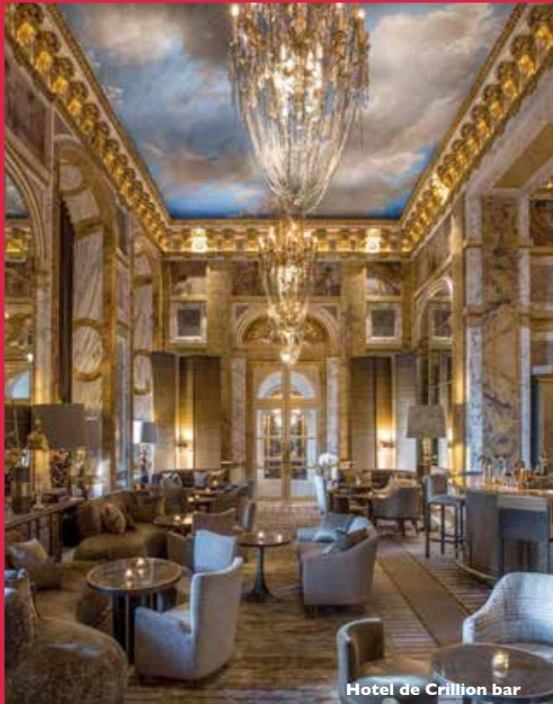
Hotel de Crillon bar