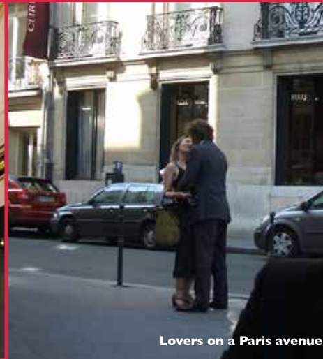
Lovers on a Paris avenue