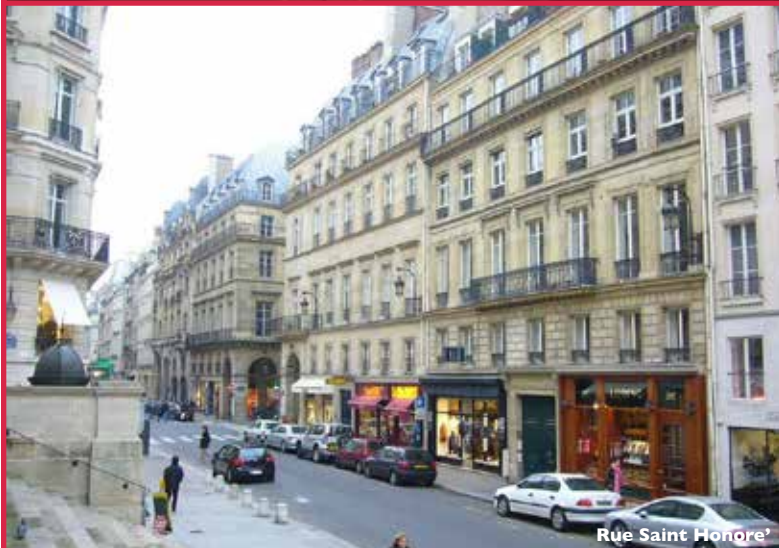
Rue Saint Honoré