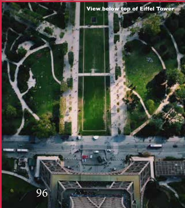
View below top of Eiffel Tower