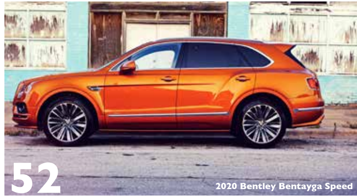
2020 Bentley Bentayga Speed