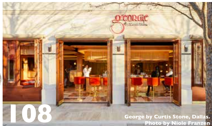
George by Curtis Stone, Dallas.