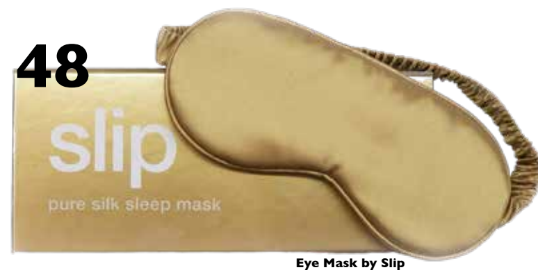
Eye Mask by Slip

Sometimes a picture can paint a thousand words as to what we are thinking.