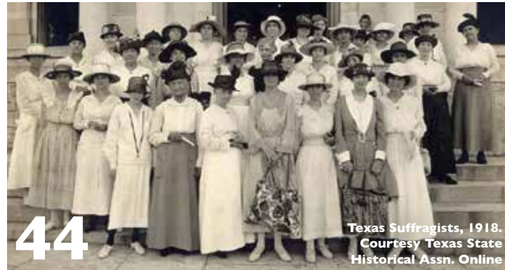
Texas Suffragists, 1918.