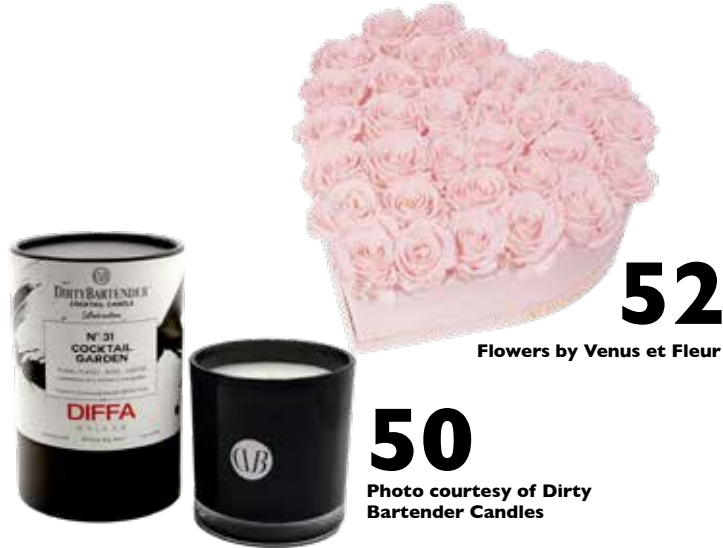
Flowers by Venus et Fleur