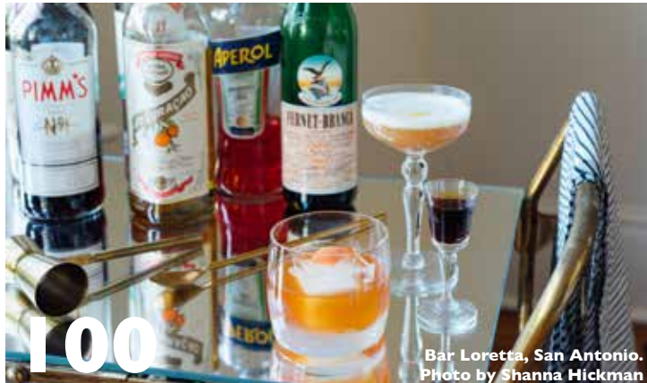
Bar Loretta, San Antonio.