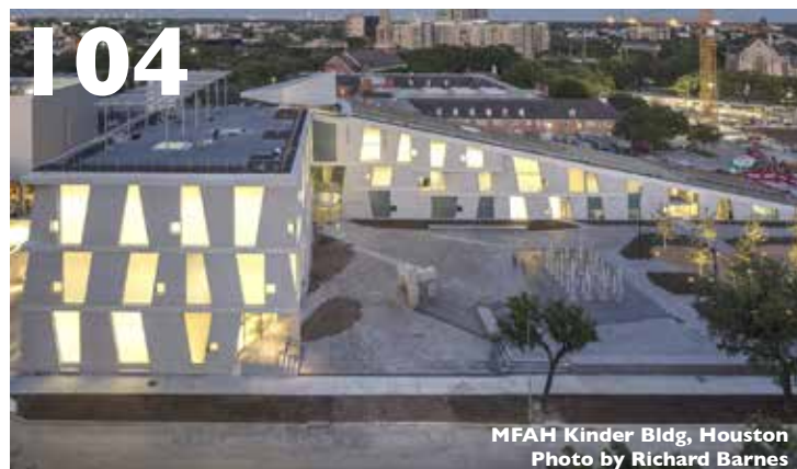
MFAH Kinder Bldg, Houston