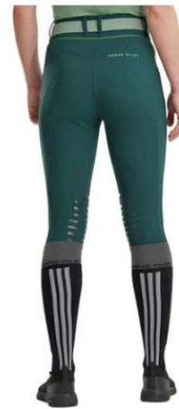
Horse Pilot X-Aerotech Green Morocco summer breeches