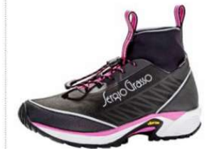
Sergio Grasso KM Plus Fucsia endurance riding boot