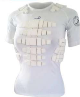
Setzi Saddles High Performance Softshield T-Shirt