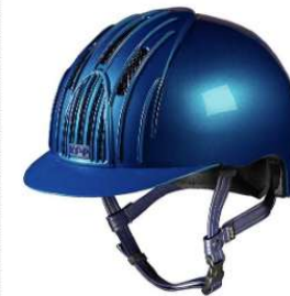
KEP Kingfisher Blue endurance helmet

If you prefer to ride without chaps, the new line of endurance sneakers from Sergio Grasso bring with them a touch of '80s nostalgia. Sporty, sleek and 100 per cent waterproof, this hybridised