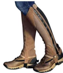
Ariat DuraTerrain waterproof boot and half chaps

has a protective exoskeleton made of a rubber composite that absorbs the shock of a fall without constricting the rider's movement in the saddle.