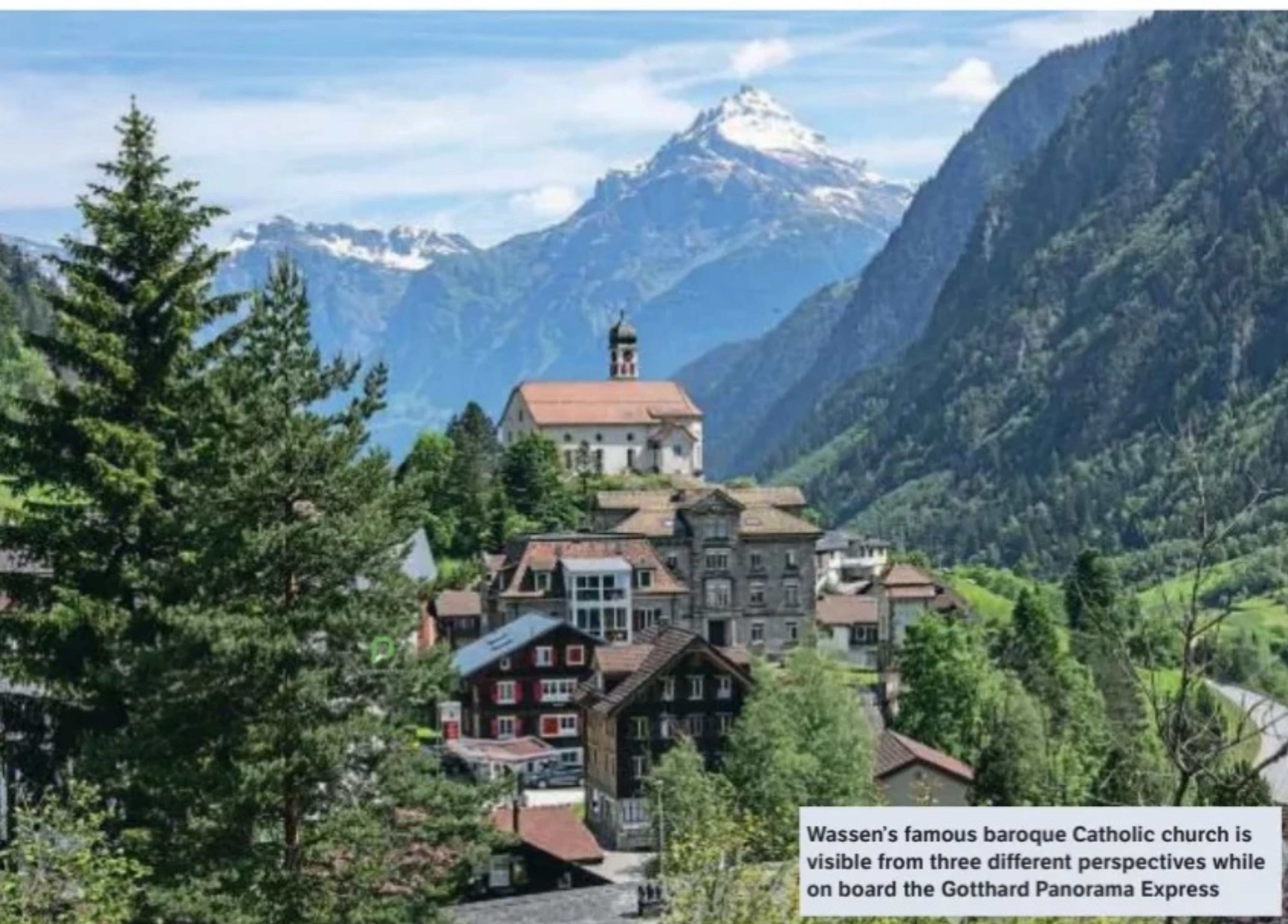
Wassen's famous baroque Catholic church is visible from three different perspectives while on board the Gotthard Panorama Express

Given the spectacle of the ride, the lakeside village of Flüelen arrives quickly — and it's here that the train terminates. But the Gotthard journey