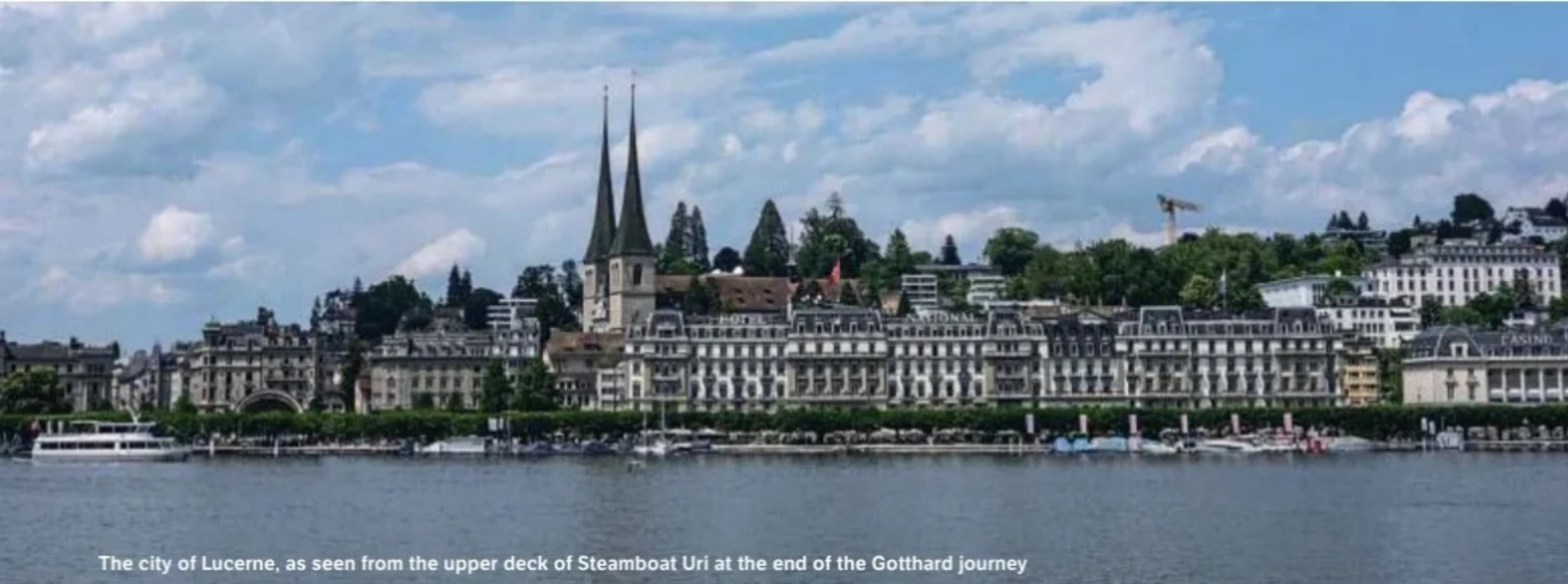
The city of Lucerne, as seen from the upper deck of Steamboat Uri at the end of the Gotthard journey

transport service offered by Switzerland Tourism to allow for maximum train hopping or mountain climbing.