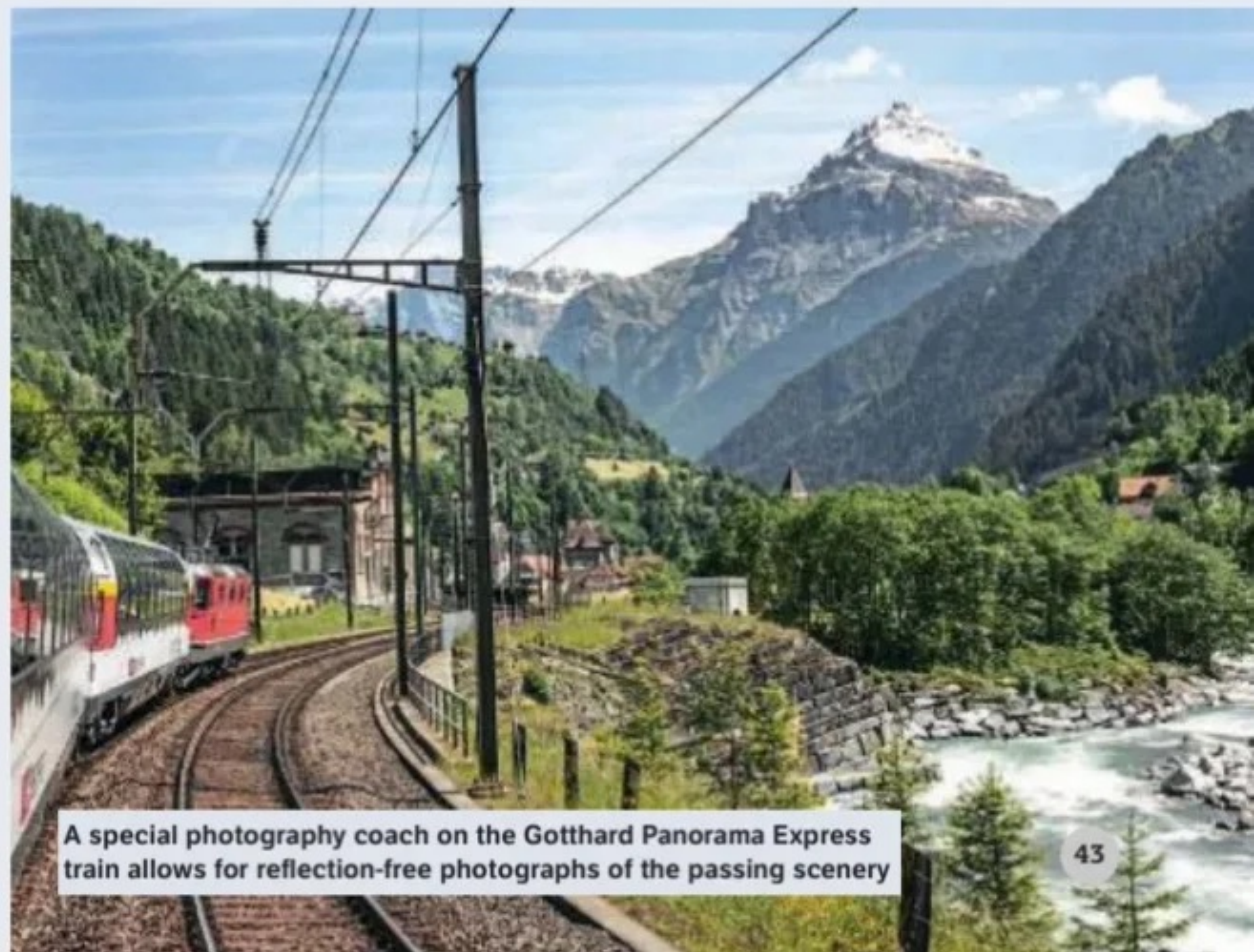
A special photography coach on the Gotthard Panorama Express train allows for reflection-free photographs of the passing scenery