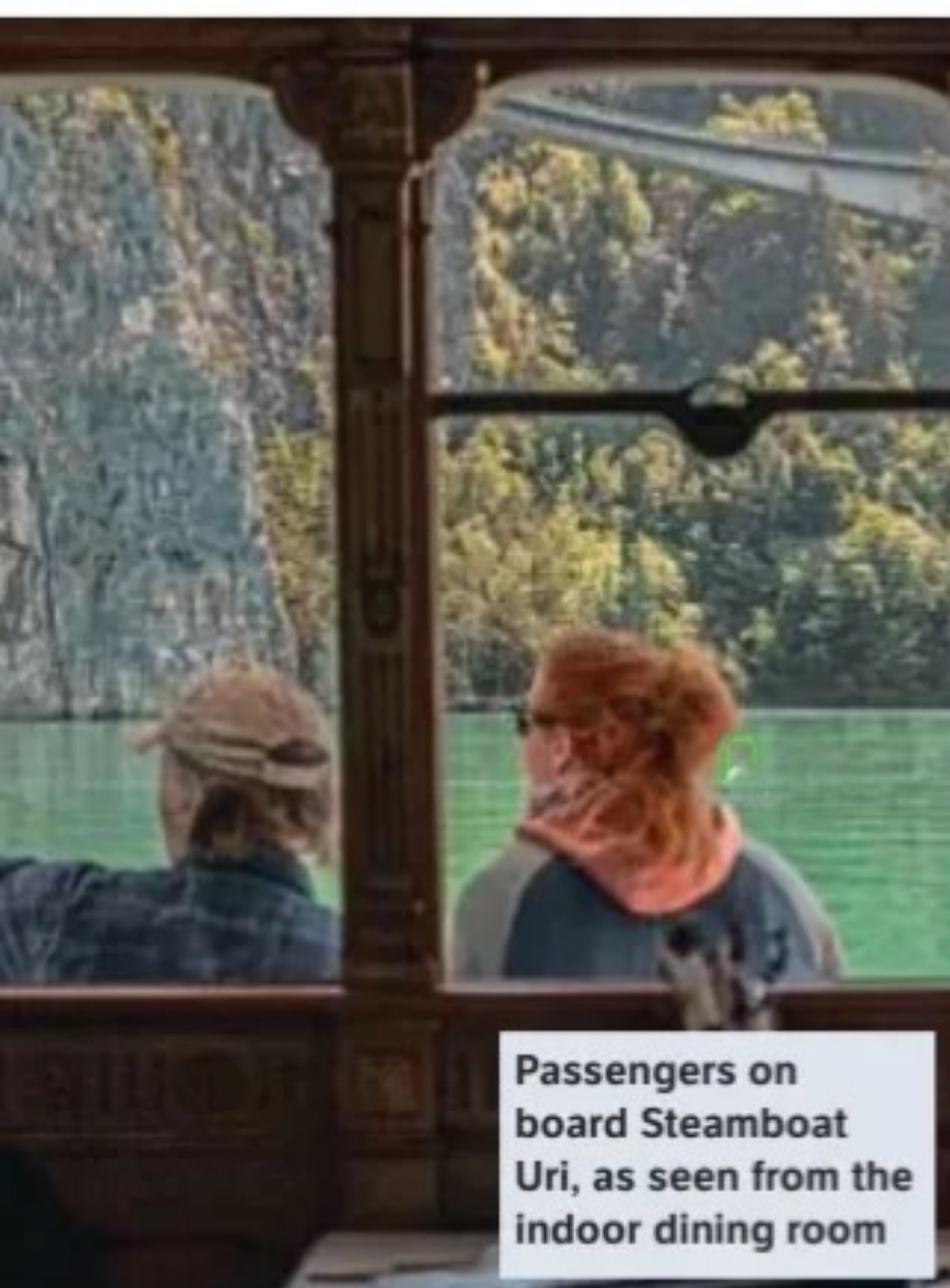
Passengers on board Steamboat Uri, as seen from the indoor dining room