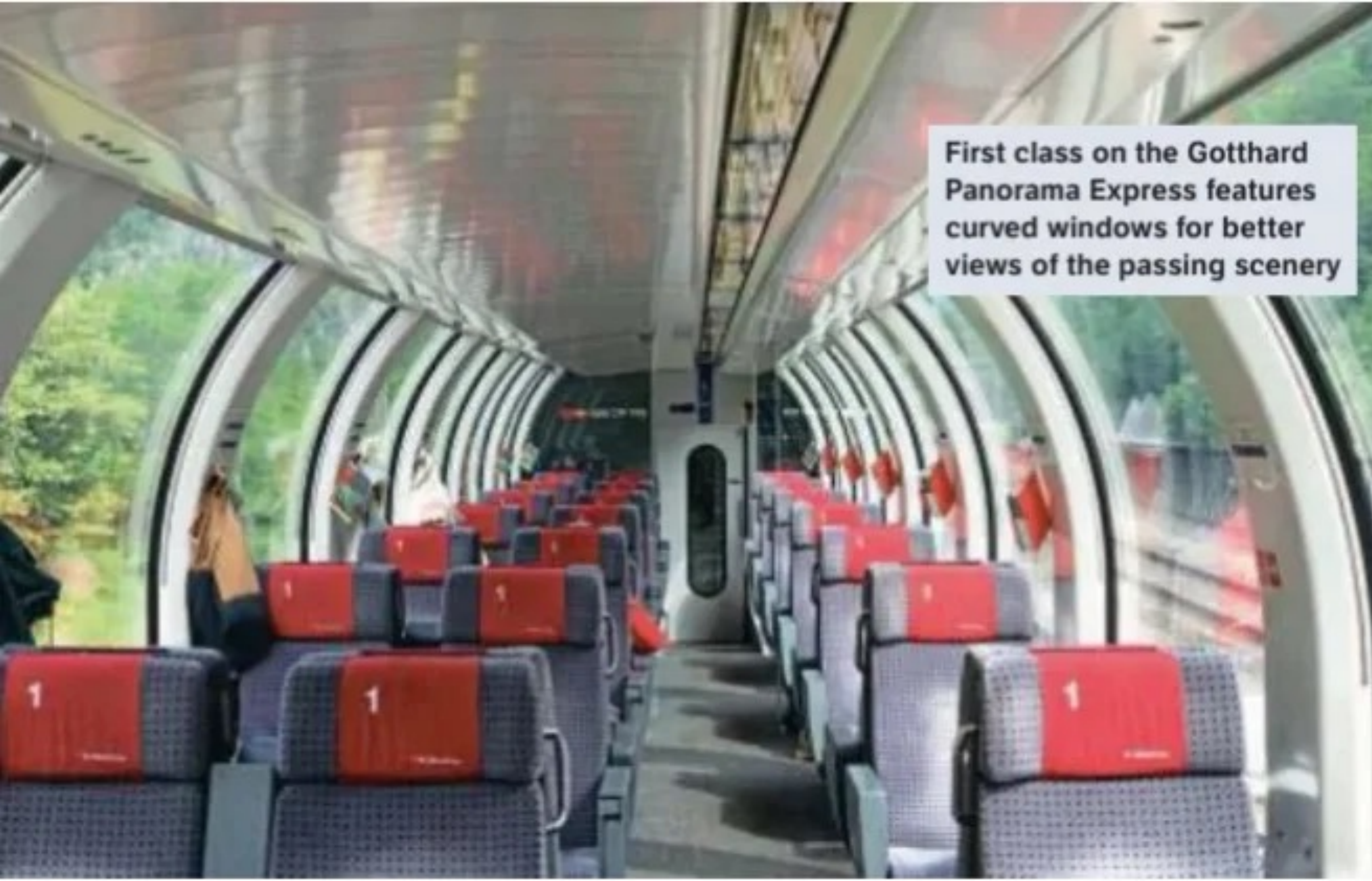
First class on the Gotthard Panorama Express features curved windows for better views of the passing scenery