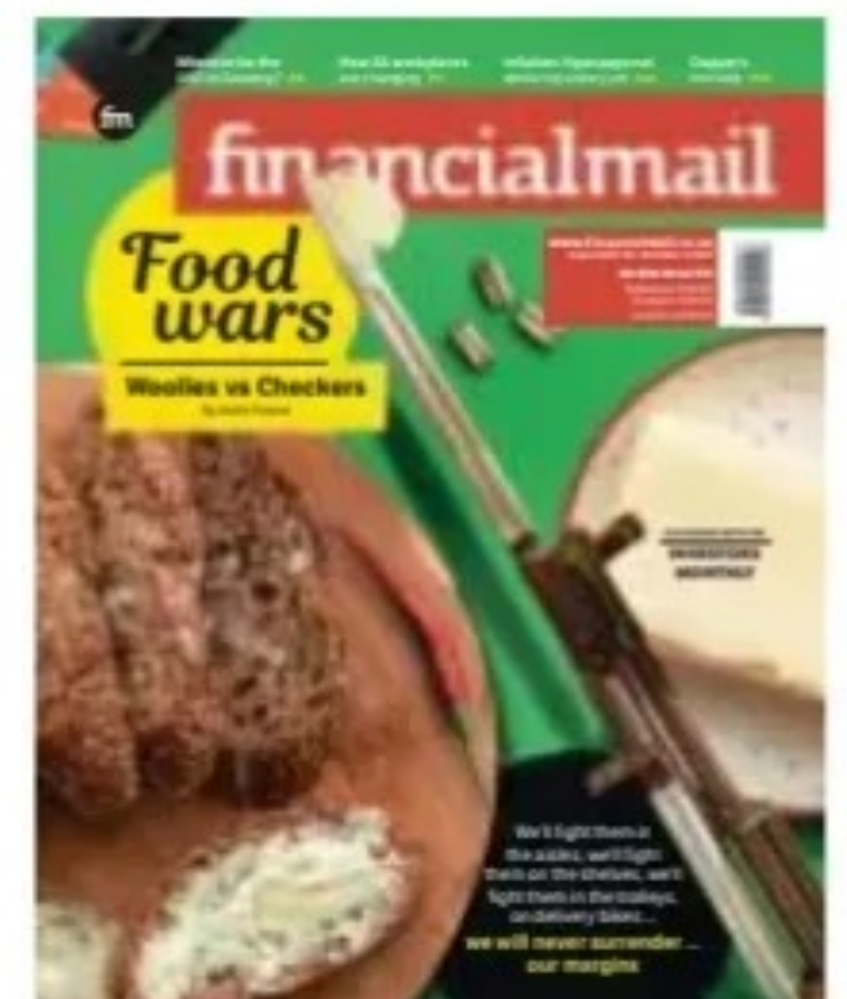
Cover: Vuyo Singiswa