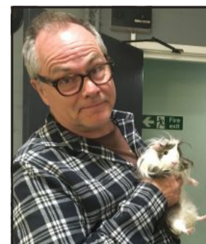
Heart of gold: Jack Dee with a Kenton guinea pig

After joking that having done lots of sitcom work in recent years he was now