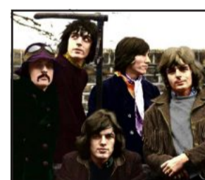
Tribute-worthy: Pink Floyd

"The classic 'Waters, Gilmour, Wright and Mason' line-up is