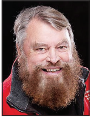
Formative influence: actor and director Brian Blessed and, below, Agatha Christie

When the plays opens, there has been a murder — a brutal murder — of an invalid matriarch as she lay in bed. There had